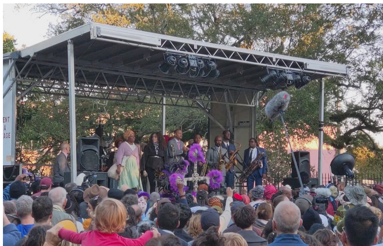
Figure 7. Slave Rebellion Reenactment, Congo Square, New Orleans, November 9, 2019.

magazine/letter-from-new-orleans-down-river-road/.