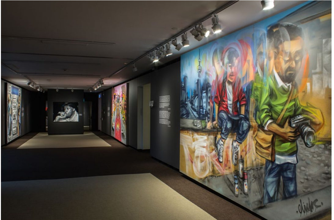
Figure 3. Elicser Elliott, T-Dot Rooftop , 2018. Spray paint on panel.