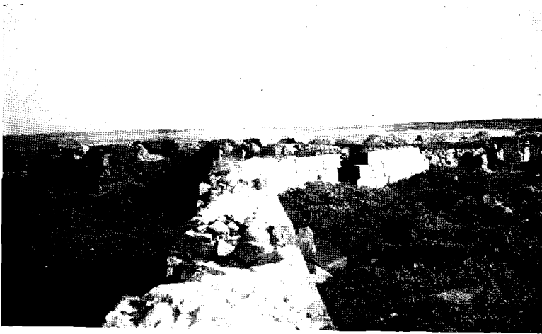
Fort Prince of Wales, Churchill, Man. View along the top of the walls (Photo., J. A. Campbell).