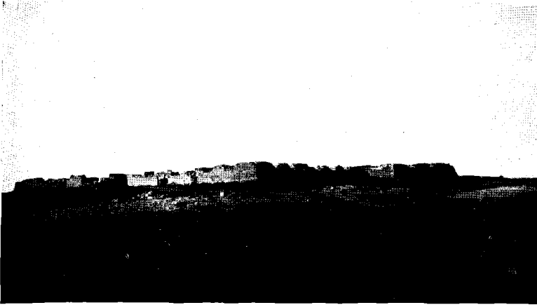
Fort Prince of Wales, Churchill, Man., at the present day (Photo., J. A. Campbell, 1919).