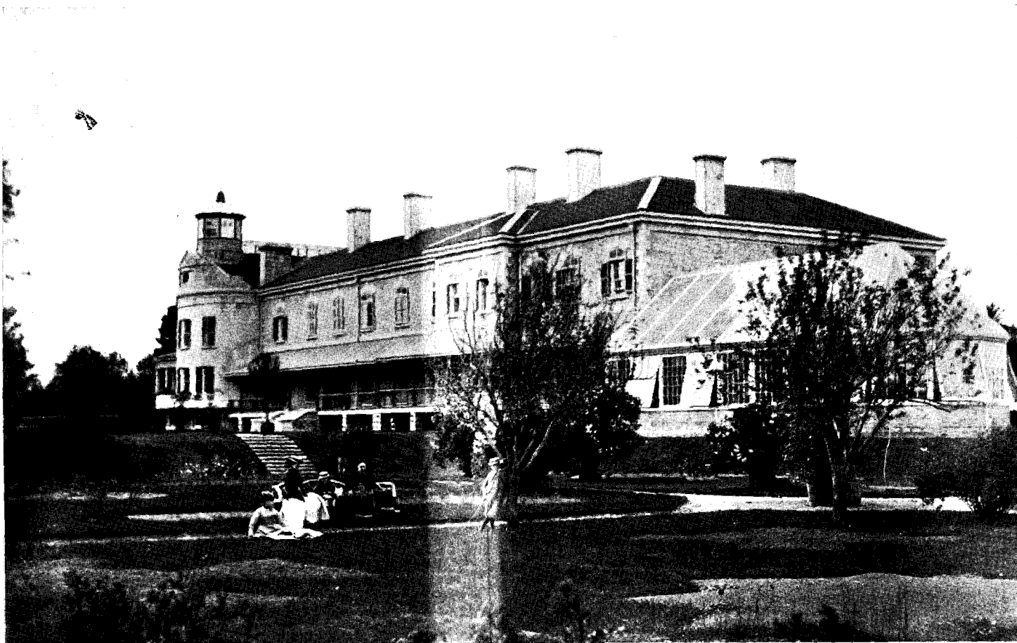
GOVERNMENT HOUSE, OTTAWA 1868