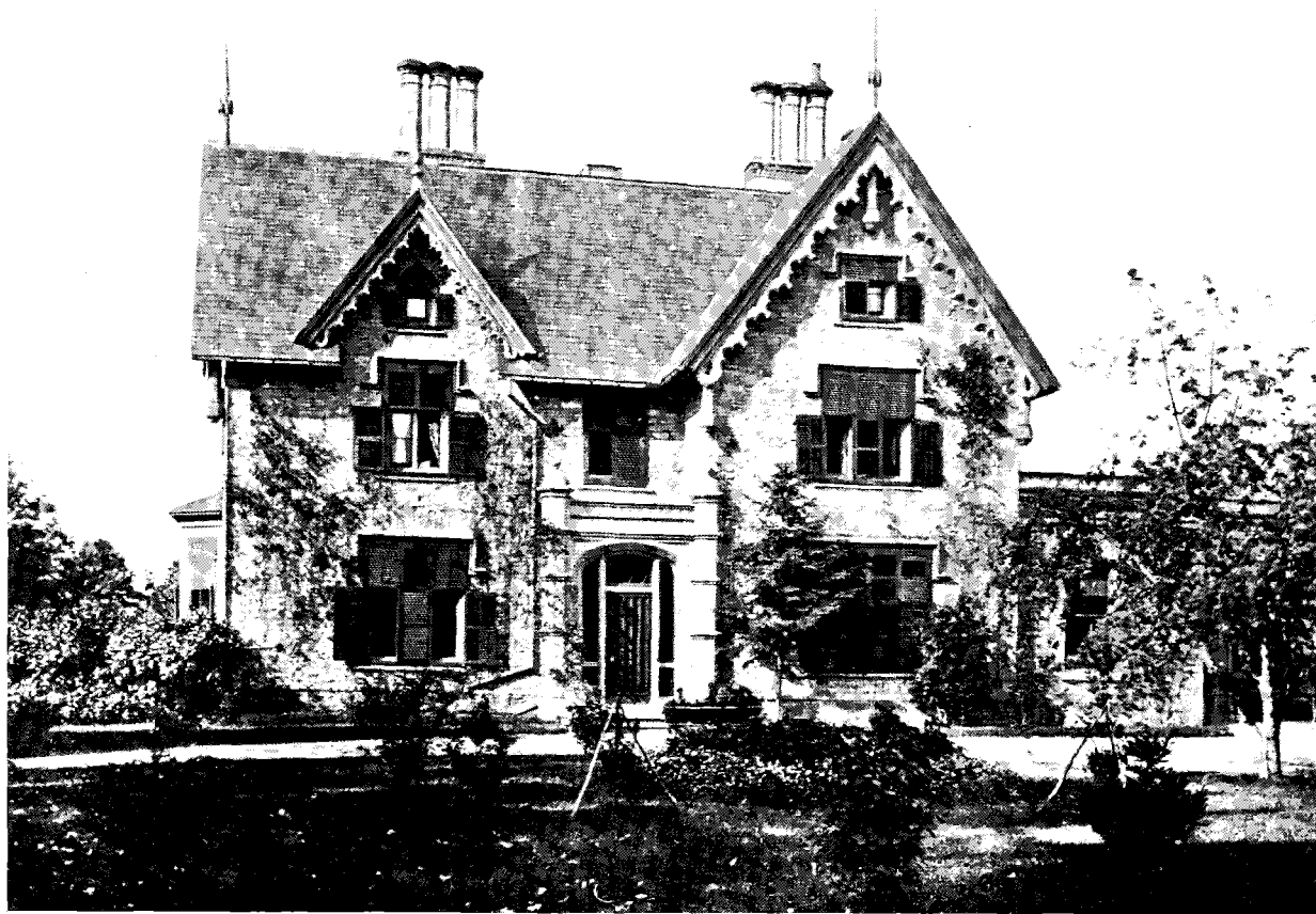
EARNSLIFFE Sir John Macdonald's residence at Ottawa