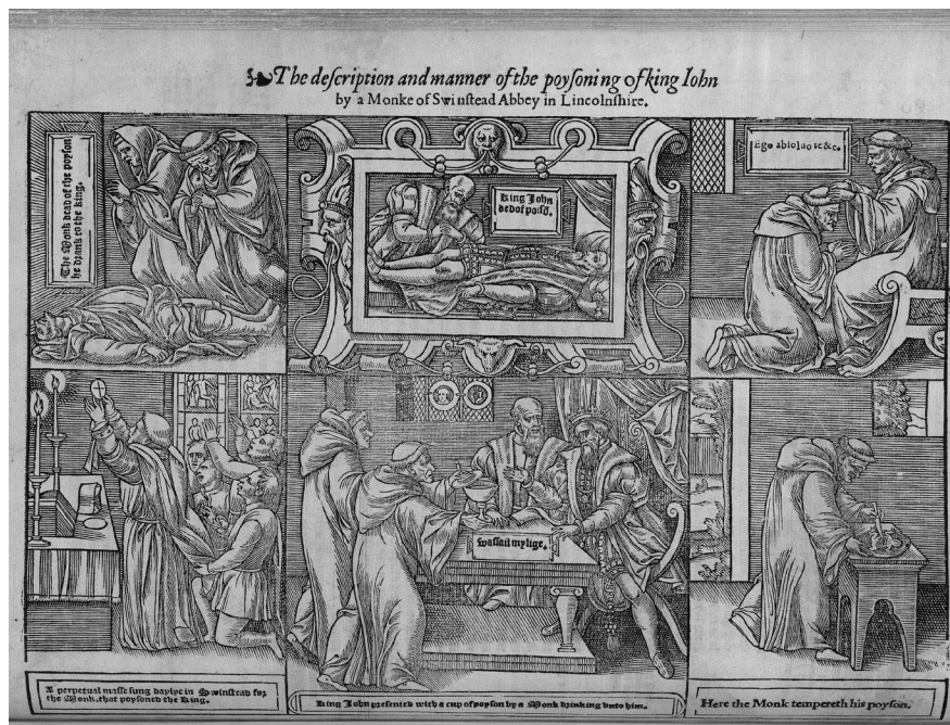
Fig. 2. John Foxe (1516–87). Actes and monuments (London: [Iohn Day], 1563, facing leaf I5 recto: The ... poysoning of king Iohn. Call #: STC 11222.

Protestant dramatists literally and dramatically demonized Catholic clergy and banished angels from their stages. 49 The plays composed by Reformers in the mid-sixteenth century used the medium of theatrical performance to address issues of doctrine, advocate for Protestant reforms, and attack the Roman Catholic Church and certain traditional practices associated with it. Stage devils continued to appear in Reformation theatre in order to “enact whatever opposed individual well-being and the sacramental community,” as John Cox