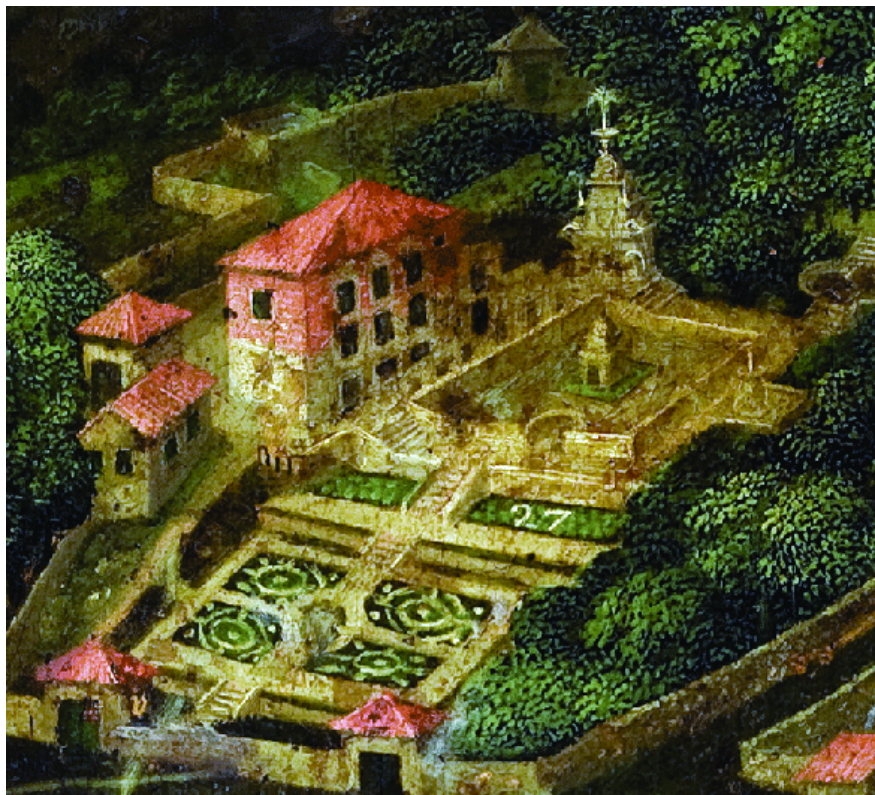
Figure 5. El Bosque of the Dukes of Béjar, Béjar (Salamanca).

Throughout the early modern period in Europe, there was a gradual transformation of the landed aristocracy into a court nobility. 112 Numerous factors shaped this process in Spain, such as the chronic debts incurred by the high nobility and their economic dependence on the crown, in addition to the progressive abandonment of their traditional residences and estates as they assumed an increasing role in the monarchy's politics and government. Absenteeism was endemic among the members of the landed aristocracy who