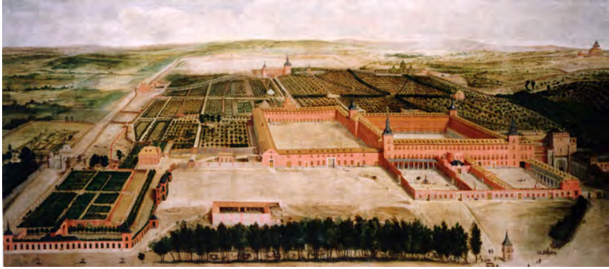
Figure 2. Jusepe Leonardo, Palace and gardens of Buen Retiro ca. 1637, oil on canvas, Madrid. Patrimonio Nacional.

Aside from the principal houses and three convents (those of the Capuchins, Saint Catherine of Siena, and Saint Anthony), to which it was connected by passageways, the huerta had a gallery with views of the prado (meadow), patios, orchards, fountains, flower gardens, a small zoo, an arena, and a bullring. Its special configuration as a space that served to display the duke's noble and political status while also providing for leisurely pursuits and a retreat from court life inspired the construction of other noble residences in Madrid. 96 Other houses with similar flower gardens and orchards were those of the counts of Monterrey in the Prado Viejo, the counts of Oñate, and the counts of Baños in Recoletos as well as the Quinta de Mirafuentes belonging to the dukes of Frías (constables of Castile). 97