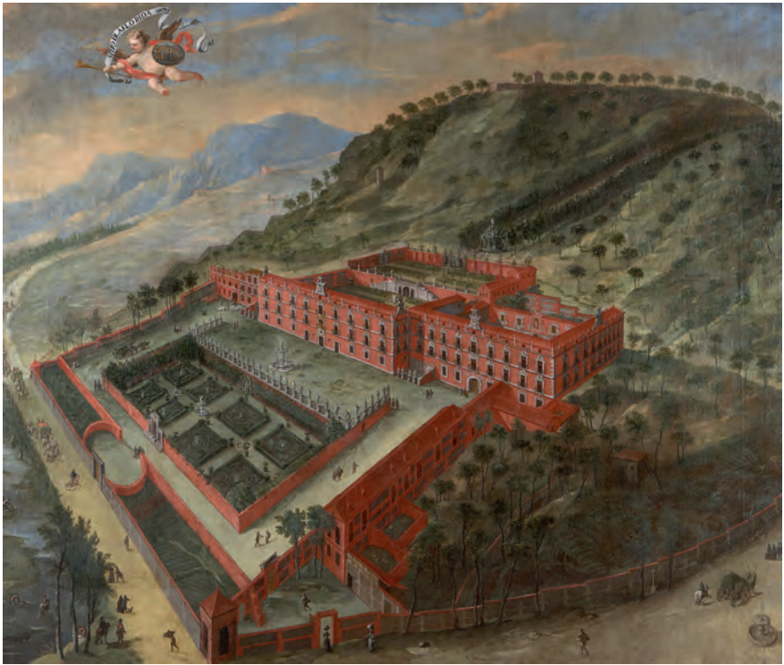
Figure 4. School of Madrid, Huerta de la Florida , oil on canvas, ca. 1670 (Colección Abelló, Madrid).

3rd marquis for his residence at court, after his death in 1675 the neighbouring land and gardens were purchased, expanding the estate to ten times its original size. It was intended as a suburban villa on the banks of the river Manzanares and was surrounded by a boundary wall. It consisted of a palace and various pavilions, fountains, water features, and terraced gardens that displayed a good part of the marquis's exceptional sculpture collection. There were also grottoes, lakes, a dovecote, stables, a chapel, a henhouse, a washhouse, snow-house, water wheel, cattle sheds, and additional gardens for flowers, fruit trees, and vegetables. This exceptional palace complex dominated, for more than a century, the city's north-eastern part at the juncture of the roads from Castile and El Pardo.