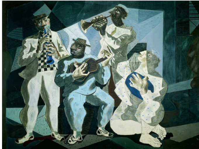
Figure 1: Chorinho by Candido Portinari, 1942 (© Candido Portinari).

According to Henrique Cazes, as the capital city grew, “[a]n urban middle class emerged, comprising public officials and small business-keepers. This middle class, largely made up of Afro-Brazilians, did not only serve as the driving force of choro , but also as the audience that consumed this type of music” (Cazes 2010, pp. 15–16; my translation). These choro groups improvised on well-known themes from European salon music, which made its way across the Atlantic to Brazil’s elite salons in Rio de Janeiro, and composed their own themes ( ibid. ). At the time, European salon music was being used as a foundation for the development of new distinct genres all over Latin and Central America (Brill 2018). Gerard Béhague, a prominent ethnomusicologist specialized in the music of Brazil, explained the transformation of European music in Brazil as follows: