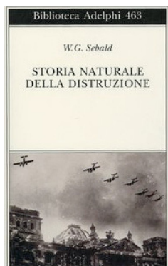
Figure 1 - Ruhe Berlin. Berlin, 30. April 1945