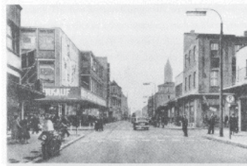
Figures 3 & 4

The pamphlet’s rhetorical strategy transforms the destruction of the “before” view into “something more like the first stage of a brave new world” ( Ibid. : 6). A similar effect is achieved by “postcards that travellers in Germany can buy today at the newsstands of Frankfurt am Main”, and on which is printed “Frankfurt — Gestern + Heute” (fig. 5). The reconstruction of cities serving to erase the country’s previous history: a focus on the future which ended up forcing the German people to “enjoin in silence about the past”, instead of working towards the positive aim of the full “realisation of democracy” ( Ibid. :7).