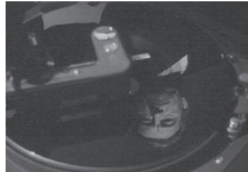
Figures 14 &amp; 15