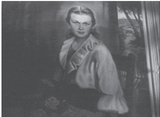
Figures 2 & 3

First, the decisive plot twist establishing that Matilda is alive is achieved by remediating her portrait (figures 2 & 3).