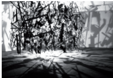
Figure 1 - Cold Dark Matter : An Exploded View , 1991. © Cornelia Parker. Permission given by artist through Frith St. Gallery, London.

' Cold Dark Matter : An Exploded View ', Tate Gallery (1991) is an installation that consists of a garden shed and its contents, blown up for the artist by the British army, and the resulting fragments suspended around a lightbulb (fig.1). Another installation, ' Colder Darker Matter ' (1997), is similarly constructed from the charred remains of a wooden church in San Antonio, Texas, that was struck by lightning. Parker asked the minister if she could take some of the charred wood as charcoal to make drawings : as she says, all she is doing is presenting the charcoal. And in that presentation, the drawing, the symbol created with charcoal, she makes tangible the event : the drawing signifies as an index of fire.