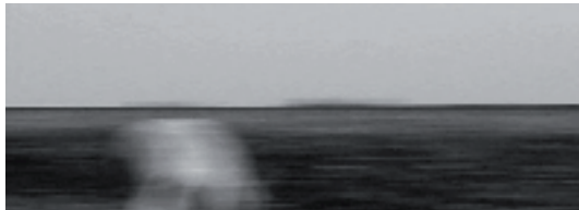
Figure 12- Still from Steppe , 1999. Louisa Fairclough.

Similarly the contemporary UK artist Louisa Fairclough makes moving image digital works that open up the field of the figurative to the haptic experience of rhythm. “ Steppe ” (1999), documents one of the many transcontinental journeys that Fairclough has made alone on her bicycle (fig.12) : “ Steppe was filmed from the level of the handlebars, the video uses a fragment from a six-week bicycle journey attempting to reach the Aral Sea.