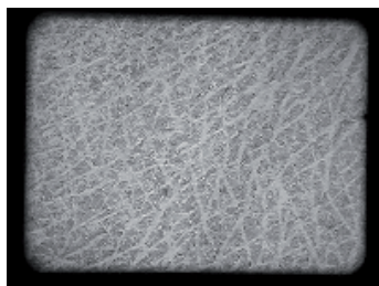
Figure 2 - Still from Skin Film , 2003. © Emma Hart. Permission given by artist.

In the tradition of avant-garde filmmaker Stan Brakhage's ' Mothlight ' (1963), which involved sticking the wings of dead moths onto film and then making a direct contact print, ' Skin Film ' 2003 (fig.2) by UK artist Emma Hart was created by transferring the outer layer of her own skin onto clear 16mm film leader using sellotape. It is important to Hart, however, that there are no prints of this film : the indexical chain of negative and positive is not extended and the viewer has to literally look through the artist's skin.