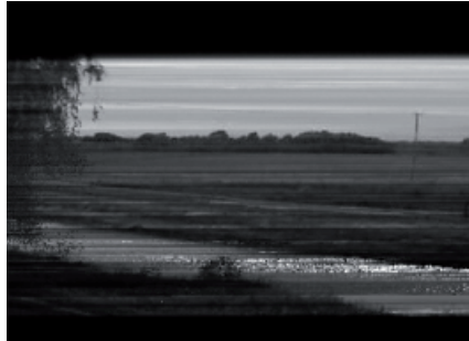
Figure 3 - Fenlandia , 2004. © Susan Collins. Permission given by artist.

Susan Collins webcast picture Fenlandia (2004) shows a complex digital-image recorded in the flat landscape of the Fens, south-east England (fig.3).