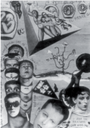
Figure 13 - Claude Cahun, Aveux non Avenue , 1930, Plate X.

Claude Cahun's 1930 Aveux non avenue (fig. 13) presents the viewer with a complex photo-collage recycling Cahun's previous self-portraits and juxtaposing the fragmented body with other visual elements. The text of Aveux non avenue is a book-length assemblage of memoirs, poems, letters, fiction, dialogue and essays that address the fallacies of narcissism, narcissistic love objects, and the panoply of sexuality. The photo-collages, which introduce each chapter, present the different arguments of the text while also operating as complex self-portraits : the self-portrait as a hypoicon, a kind of metaphor of disparate elements held together by the frame of the page.