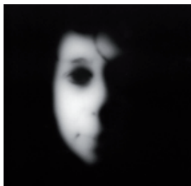
Figure 11 - 2XDH, 2001.

Contemporary artist Helen Sear literally sandwiches together two separate negative portraits of the same person leaving a small gap between the negatives, and prints them together : two indices collided into a hypoicon (fig.11). The power of the photograph resides in the indeterminacy of reference. The individual is poised on the verge of disappearance into light and darkness – a quality of strangeness impossible to verbalise, that approaches the condition of Peirce’s First of Firstness, the image.