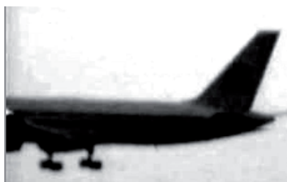
Figure 4a & 4b - Short Films About Flying , 2001. © Thomson and Craighead. Permission given by artists.

Short Films About Flying is a networked installation by Jon Thomson & Alison Craighead in which an open edition of unique cinematic works are automatically generated in the gallery, and in real-time from existing data found on the world-wide web. Each 'movie' (replete with opening titles and end credits) combines a live video feed from Logan Airport in Boston with randomly loaded net radio sourced from elsewhere in the world. As this relatively good quality video stream is taken from an existing commercial website where its visitors are able to remote control the camera, each 'movie' is 'shot' and 'paced' by its own (albeit unsuspecting) camera person.