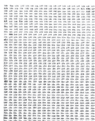
Figure 5 - Six Million . © Fanny Aboulker. Permission given by artist.

Employing a different strategy, Fanny Aboulker (fig.5) has set herself the task of writing by hand the numbers one to six million, as a memorial to those who died in the Shoah :