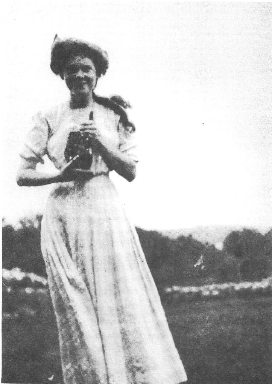
Ill. 4. Unidentified Ottawa 'snapshooter,' ca. 1910.