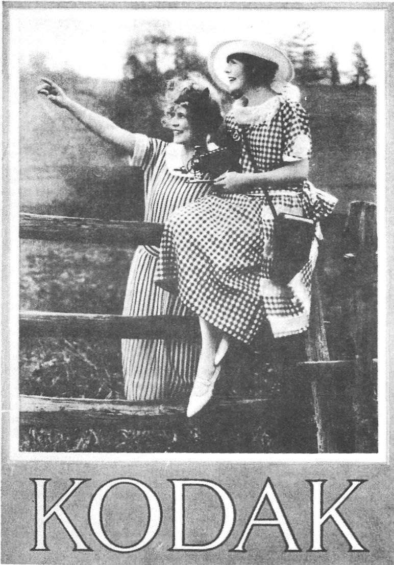
Ill. 3. Kodak promotional photograph, ca. 1924.