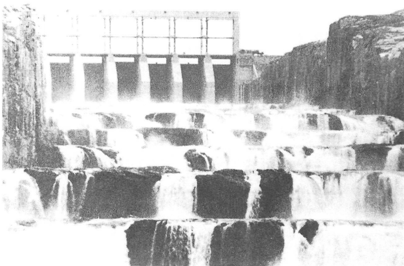
The spillway at La Grande 2 (LG2), major installation of James Bay project, phase 1.