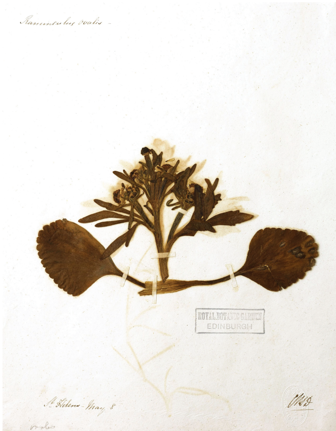
Figure 1: Ranunculus rhomboideus , (prairie buttercup), found in herbarium of Christian Ramsay, Lady Dalhousie, and collected on Île Ste-Hélène, May 8, [? 1824], new to Quebec then, but now extirpated.