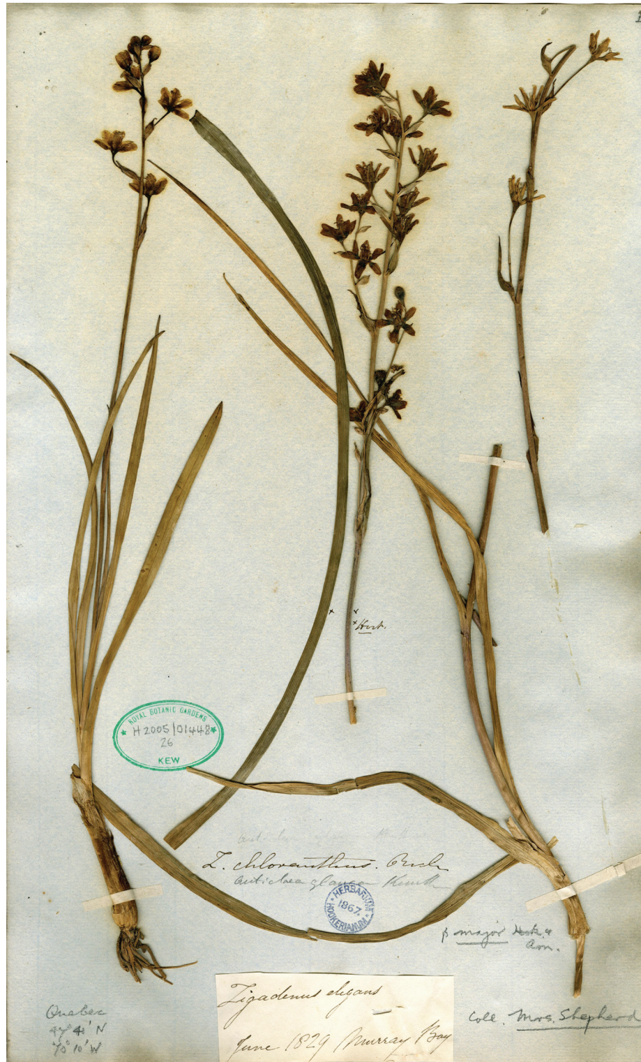
Figure 3: Zigadenus elegans (now Anticlea elegans , mountain death camas), collected by Harriet Sheppard, June 1829, at Murray Bay. Herbarium of the Royal Botanic Gardens, Kew; photo AAFC.