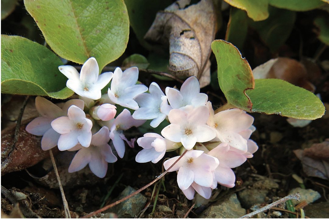
Figure 1. Mayflowers in bloom.