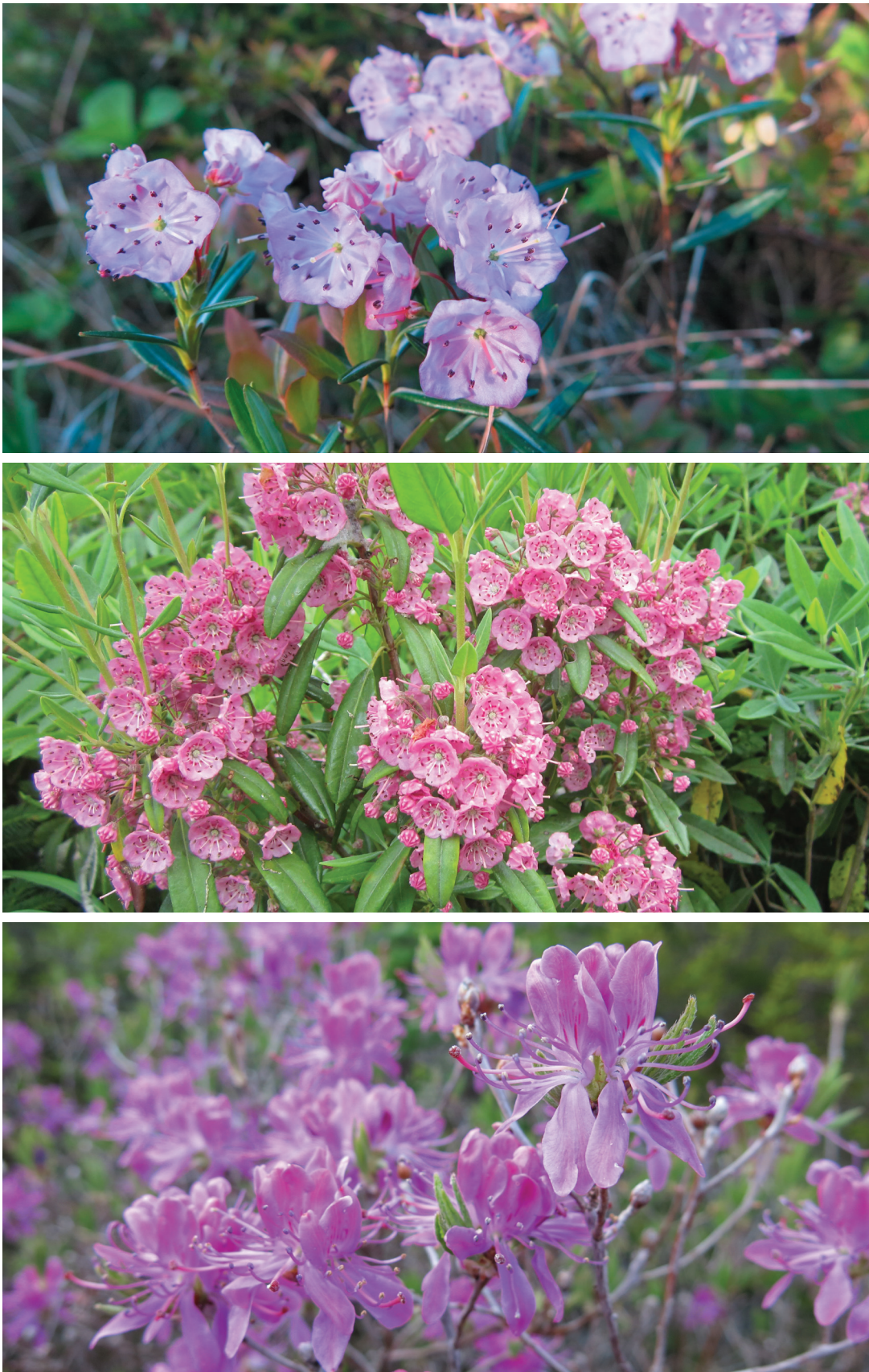
Figure 4. (Top to bottom) Pale Laurel, Lambkill, and Rhodora in bloom.