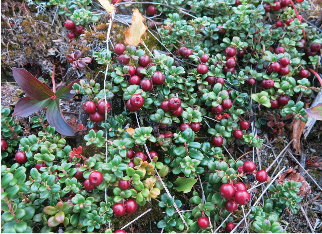
Figure 6. Foxberries.