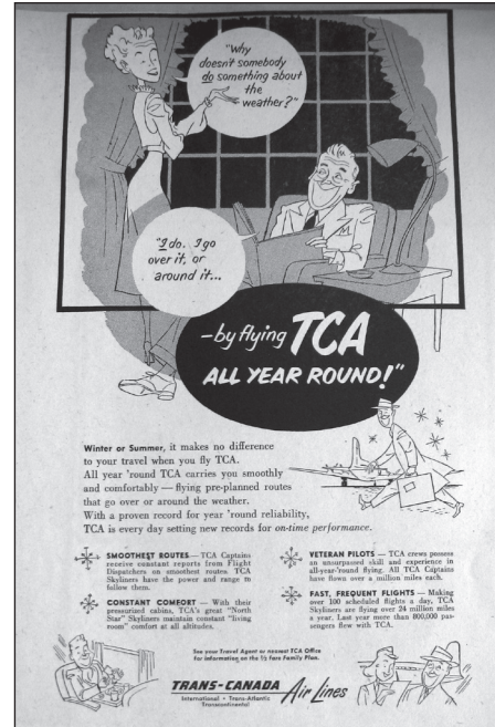
1951 TCA Advertisement. One of the figures reproduced in Made Modern.