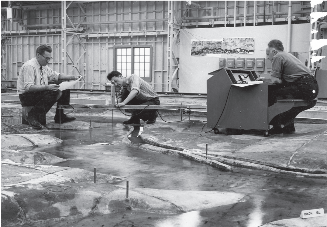
Ontario Hydro model in a warehouse at Islington, Ontario. One of the figures reproduced in Made Modern.

of “small science” as quintessentially Canadian, as seen in a lonely computer scientist, trained in physics, working at the Montreal Neurological Institute. But he was hired to do service work for a larger scientific community very conscious of its collective identity and national prestige.