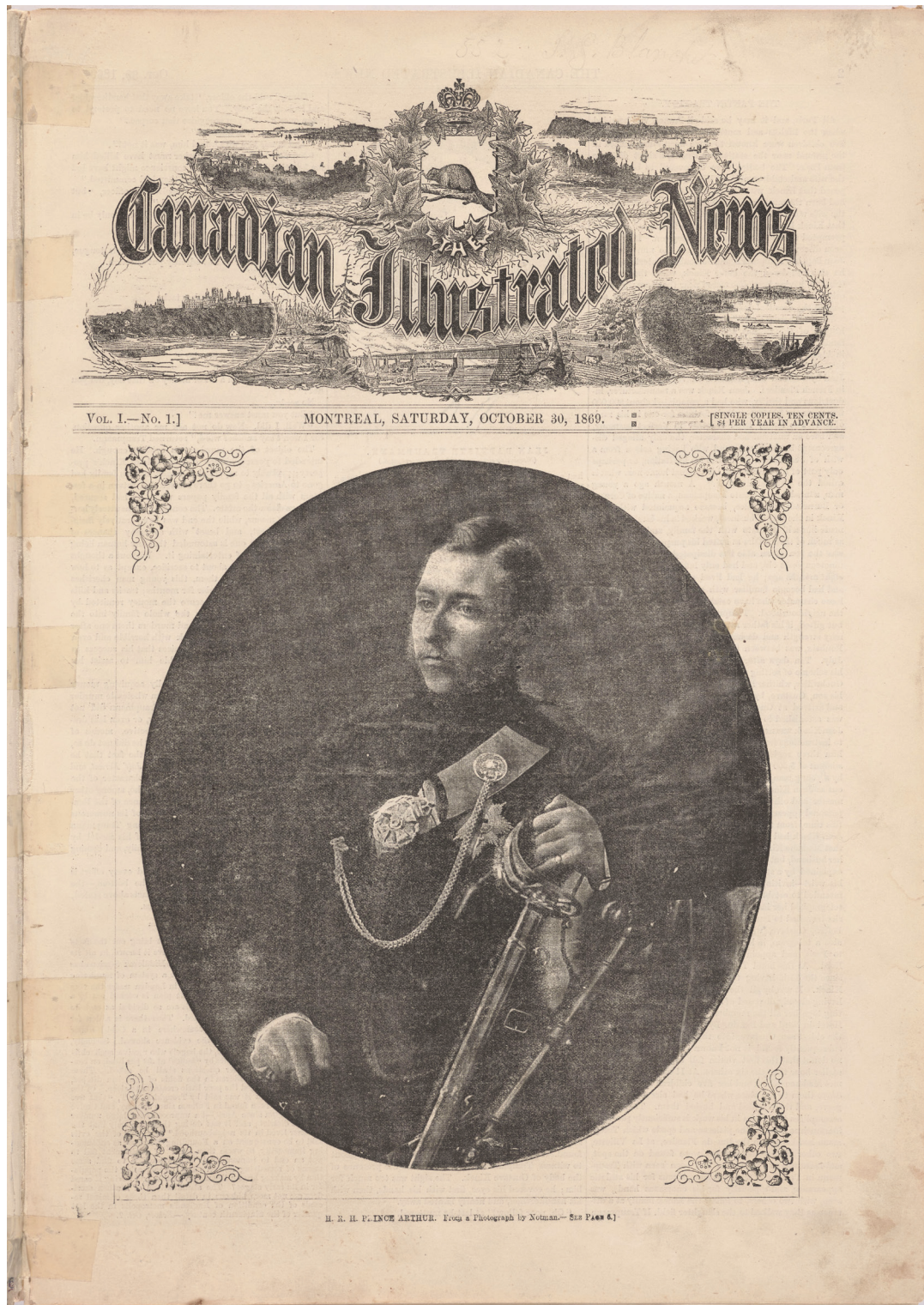
Figure 3. Canadian Illustrated News 1.1 (30 October 1869): 1.