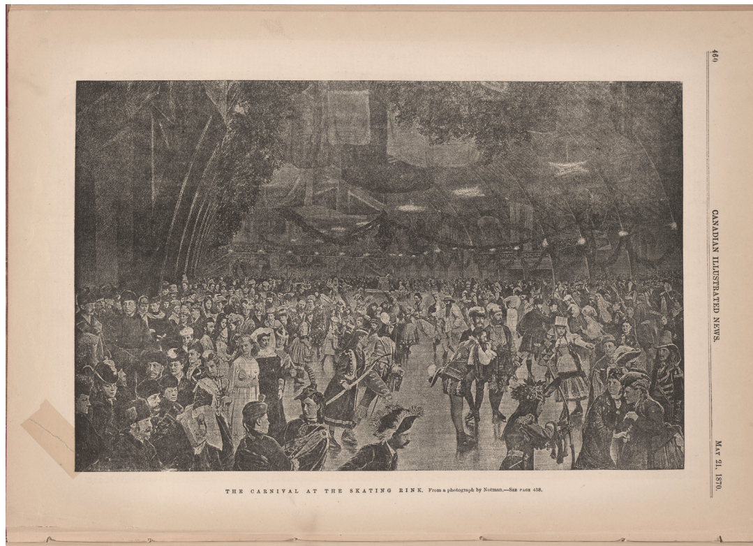
Figure 4. “Carnival at the Skating Rink,” Canadian Illustrated News 1.29 (21 May 1870): 460.