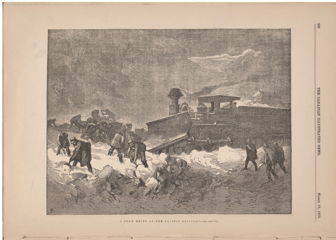
Figure 1. “A Snow Drift on the Pacific Railroad,” Canadian Illustrated News 1.20 (19 March 1870): 308.

two decades. 2 In the late 1890s, the halftone process was finally widely adopted by the Western illustrated press, and photography joined the panoply of illustrative techniques still in use to become a regular feature of mass media.