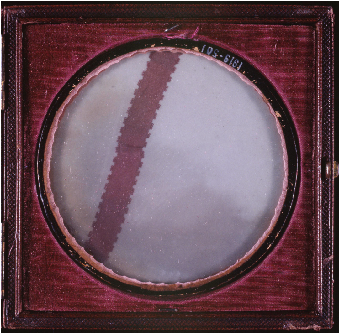
Figure 1. Original glass negative photograph of the 40' telescope at Slough, produced in 1839 by Sir John Herschel, SMG 1919-501.

The NSMM has a complex history related to how it has approached the relationship between science and its photographic collections. 6 The museum opened in Bradford in 1983 as the National Museum of Photography, Film and Television. The collections of the museum included objects foundational to the histories of these three media, including the William Henry Fox Talbot collections; the first moving-image cameras used by Louis Le Prince; and the experimental television apparatus of the Scottish inventor John Logie Baird. In 2006, the museum became the National Media Museum with the expansion of our collecting areas to include the broader creative industries of gaming and digital computing. In 2017, the museum's name changed again becoming the National Science and Media Museum. NSMM's relationship to science and to photography in particular has, therefore, always been intertwined with the broader concepts of media heritage.