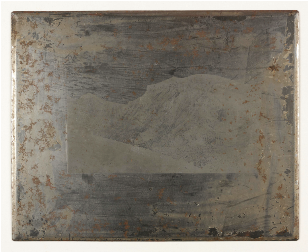
Figure 3. 'Mount Guajara' Photoglyphic engraving plate made by William Henry Fox Talbot from glass plate positive produced by Charles Piazzi Smyth, SMG 1937-526