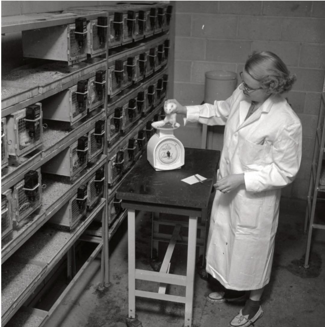
Figure 3. “New cold lab work at medical school [performed by unnamed scientist].” Credit: Archives and Special Collections, Western University, AFC 177-S1-SS2-F1334, LFP, March 17, 1953, London, Ontario.

By in large, the Weather Factory represented a gendered space. A select group of male professionals with connections to the Canadian defence department facilitated the financial and institutional support required to construct and operate the research facility. While women scientists worked in the laboratory, as the surviving records demonstrate, most of the users were men and they produced research to serve the specific military needs of predominantly white male service personnel. This fit a wider pattern of DRB-funded research in post-war Canada. Institutionally, senior scientists in the DRB employed or funded relatively few women scientists and engineers during the early Cold War. 45 The government branch did not discriminate against women’s professional work, but the DRB’s institutional mandate prioritized service needs and adopted the male-dominated cultural practices of DND and the armed services.