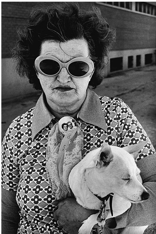
Featured in Geist 66.