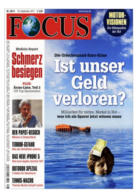
Focus, September 2011