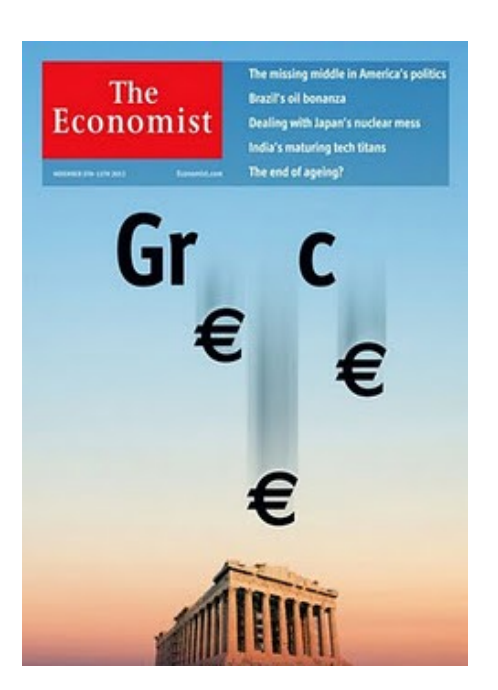
The Economist, November, 2011