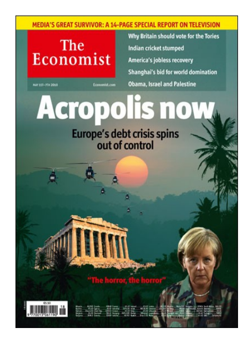
The Economist, May 2010