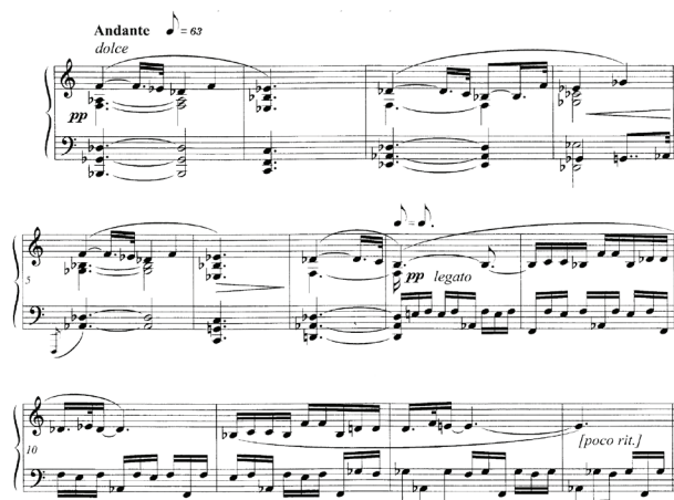
Example 4: Eduard Tubin, Piano Sonata No. 2, mov. 2, mm. 1-13

Copyright 2009 by the International Eduard Tubin Society. Reproduced by permission.