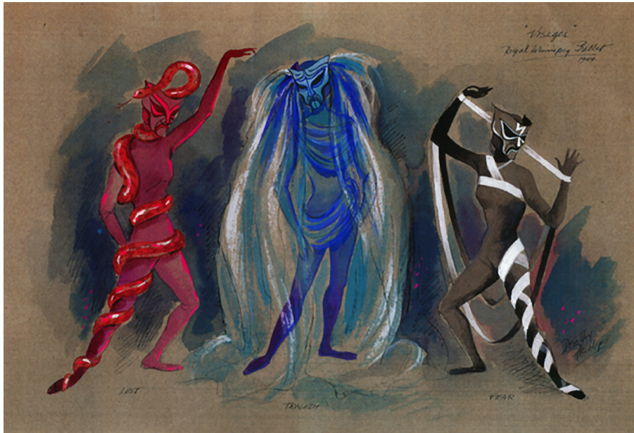
Figure 2: Sketch by Dorothy Phillips for Visages .

eleven-minute film was shot under the direction of Roger Blais. The excerpt from Visages is the longest of any single ballet on this film. It is 2 minutes and 19 seconds long (Blais 1949, 3:42 to 6:01). 8