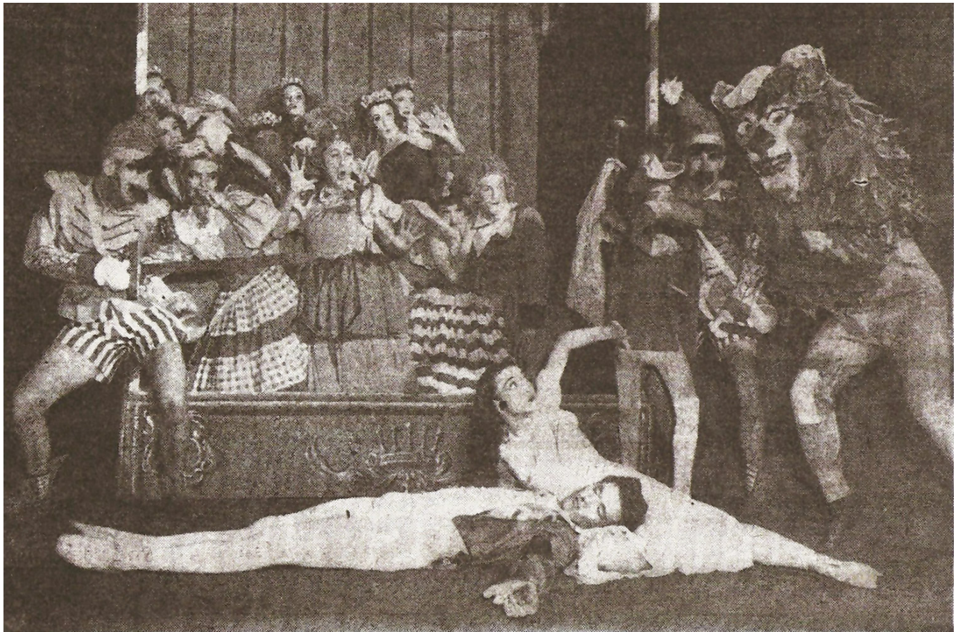
Figure 4: Still from Act 3 of The Rose and the Ring (“Ballet Fantasy” 1949, 13).

His theme for Princess Betsinda is nostalgic in character in which the strings achieve beautifully rich harmonic effects at various intervals during action in which she is chief participant—notably the pas de deux with Prince Giglio.