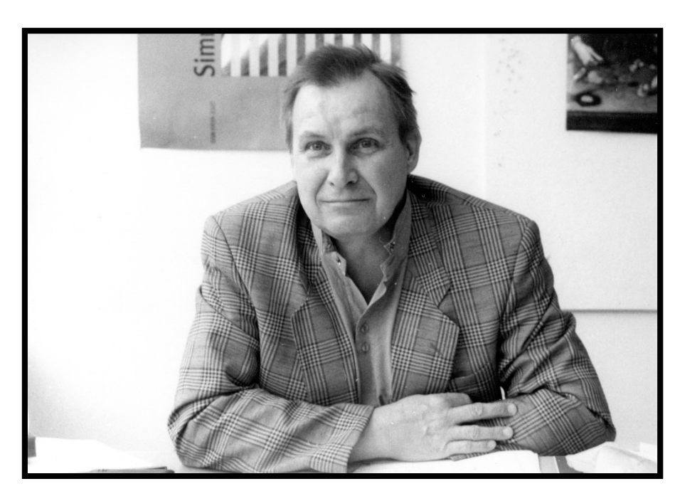
Rammstedt 1993.