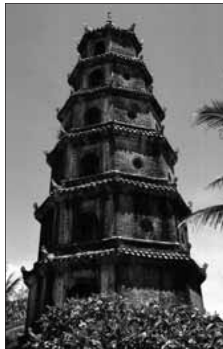
Monument on the banks of the perfume River, Hué aera, Vietnam.

A common way to assess nonresponse bias is to compare socio-economic characteristics of respondents with nonrespondents (Dey, 1997; Sheaffer et al. , 1996; Stoop, 2004). Because our unit of analysis is an organization, we used two proxies (the firm location and type of ownership) to assess nonresponse bias for both hotels and tour companies. The firms were located in three administrative regions: north, south, and central. Their types of ownership were SCs, JCs, PCs and ECs. Chi-square test results show insignificant differences in terms of location between respondents and nonrespondents ( p > 0.1 ) of both hotels and tour companies. However, with p < 0.01 , the Chi-square test results indicate a significant difference between respondents and nonrespondents in terms of ownership among tour companies, while it is not statistically significant among hotels. Among tour companies, JCs are the most responsive, while PCs are the least responsive to the survey.