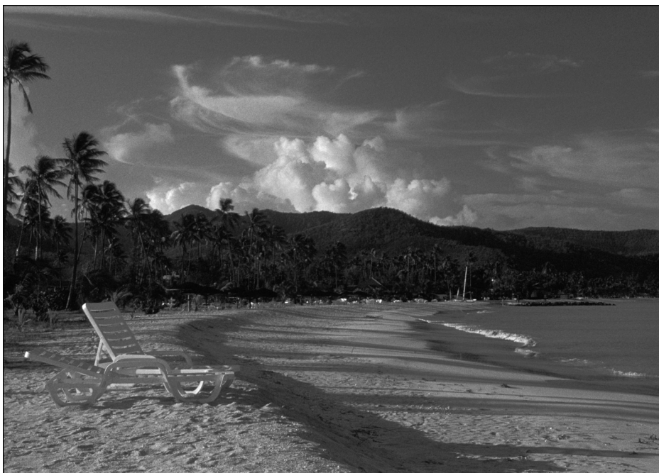
The constructed beach at Jolly Harbor, Antigua. Both sand and palm trees are imported to construct a simulacra of a tropical beach.

Antigua, a small island in the West Indies, provides a good illustration of how tourism might affect environments and environments affect tourism, and how we might understand and manage those interactions more effectively for all concerned. The tourism industry employs over half of the Antiguan labour force, generates a per capita GDP (gross domestic product) of US$7500, and is directly responsible for 60% of the island's GDP (ABDT, 1996; ABMF, 1996; EC, 1996; The Courier , 1997 : 36; Gortier, 1997 : 32). Over 95% of all hotel rooms are in beach resorts. Antigua is known for and promoted as a place for quiet and/or romantic beach vacations. Peter Ramrattan, the head of Antigua's Hotel and Tourism Association, characterized the island's tourist clientele as the "newly wed and the nearly dead" (1997). Though now adding "The heart of the Caribbean" to the Antiguan brand, the slogan "365 powdery white sand beaches... one for every day of the year" has been used for decades (AHTA 1996, 31).