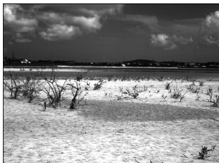
Dead mangrove community at McKinnon's Salt Pond.