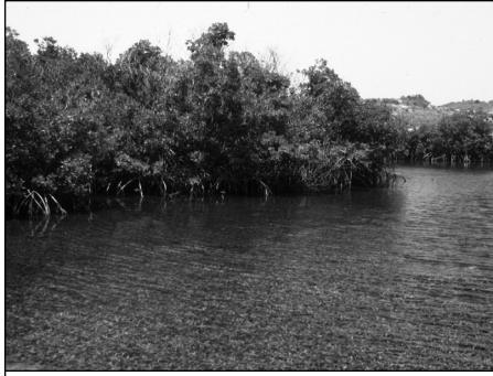
Undisturbed Mangroves near English Harbour.