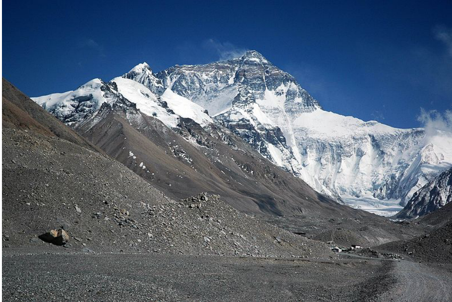
Image: Anonymous, Mount Everest from Rongbuk , May 2005, photograph, https://commons.wikimedia.org/wiki/File:Mount_Everest_from_Rongbuk_may_2005.JPG .

summit, to place one in the empathetic perspective of the summit, to lose oneself there in the contemplation of the mountain as it has withstood our history.