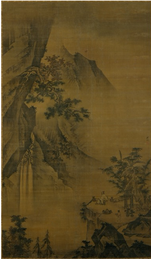
Image: Zhong Li, Scholar Looking at a Waterfall , ca.1480-1500, hanging scroll, ink and color on silk, Metropolitan Museum of Art, New York, New York, https://www.metmuseum.org/art/collection/search/44703 .

Flux sometimes surfaces even from within the mountain we are not: jittery streams trickle from the sheer rockface, sparkling in sunlight, trailing their own particular clarity down onto pebbles of quartz and striped jasper, which look always smarter, sharper, being wet. We don't know the source, and hesitate to climb and find it (ticks abound), so we fall back on these obsessions, analogues to the source: time as a river in which our images, distorted, reflect ever onward.