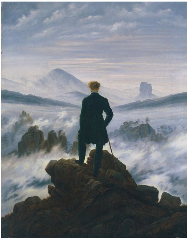
Image: Caspar David Friedrich, Wanderer above the Sea of Fog , ca. 1817, oil on canvas, Kunsthalle Hamburg, Hamburg, Germany, https://en.wikipedia.org/wiki/Wanderer_above_the_Sea_of_Fog#/media/File:Caspar_David_Friedrich_-_Wanderer_above_the_sea_of_fog.jpg .

Yet when one is in nature – when one listens silently to the pines’ masts creaking above on their voyages, does one feel this duality between “human” and “nature,” or between “oneself” and “other,” wholeness with difference? I personally only really remember the half loaf of bread, the moss, slugs, conspicuous lack of predators, eerie pines above, when I spent time in the hills north of Aberdeen, Scotland. Perhaps the arts even compel us, in the way they represent nature, to trade in dualities.