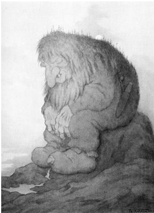
Image: Theodor Kittelsen, Trollet som grunner på hvor gammelt det er ( The Troll Who Wonders How Old He Is), 1911

In “The troll who wonders how old he is” the Norwegian artist Theodor Kittelsen draws an aged being whose form both conforms to and extends the hillside; there he forms his own mountain, even while remaining identifiable to us as other, as a troll: we see his holey boots, his gnarled hands, his side knife. 3 At rest, he seems almost to be dozing on his knoll, remembering how there were once many more of his kind, much as a mountain can be lost in the immensity of its years, the inexact duration represented in the fine tree-like hairs raised from his shaggy mane, beyond which a pale sun is setting.