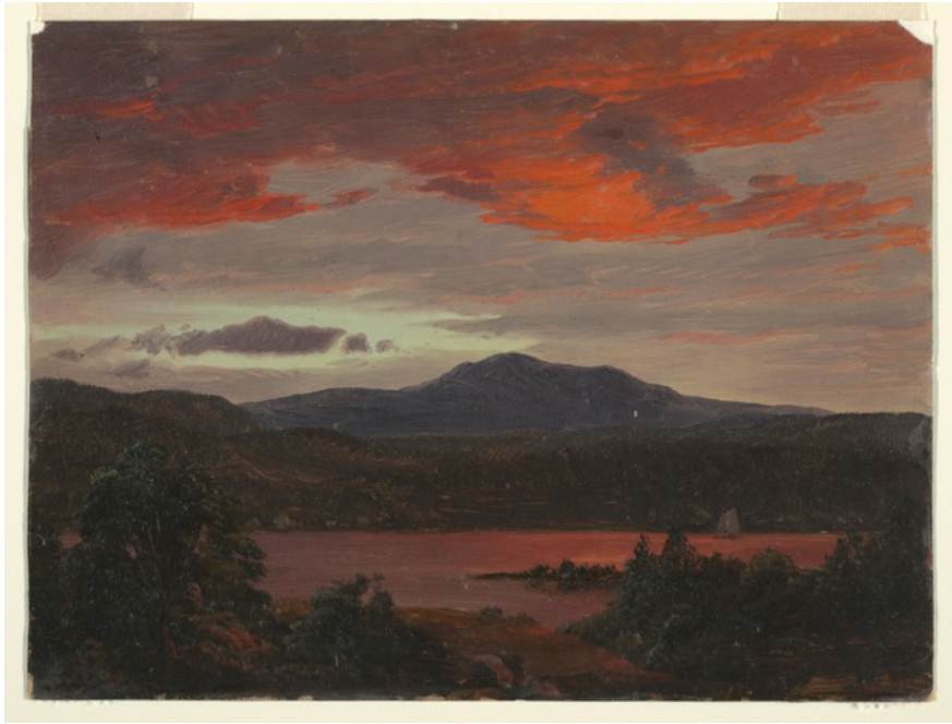
Image: Frederic Edwin Church, Drawing, Mount Katadhin from Lake Katadhin, Maine, ca. 1853 , brush and oil paint on thin paperboard, Cooper Hewitt Smithsonian Design Museum, New York, New York, https://collection.cooperhewitt.org/objects/18196989/with-image-19614 .