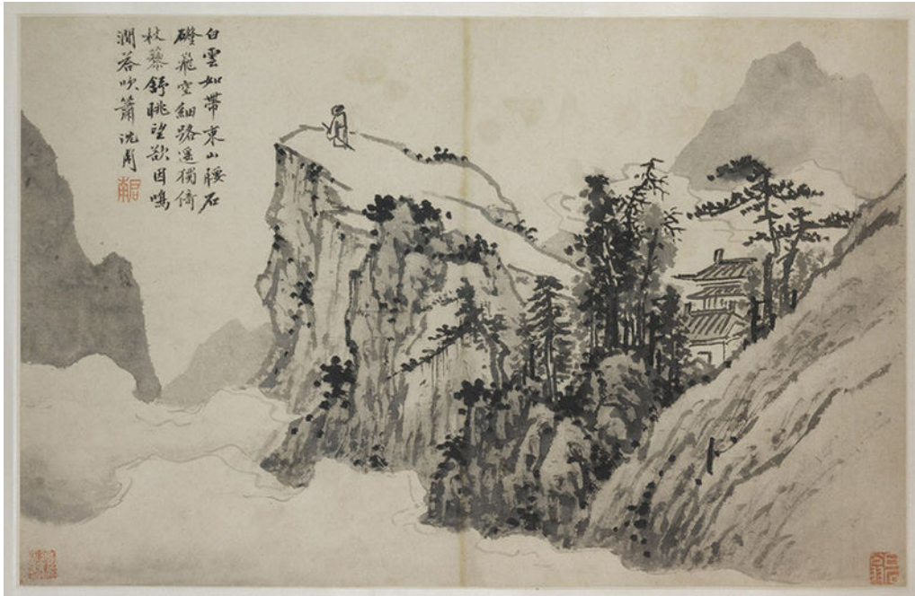
Image: Shen Zhou, Poet on a Mountaintop , ca. 1427-1509, album leaf, ink on paper, The Nelson-Atkins Museum of Art, Kansas City, Missouri, https://commons.wikimedia.org/wiki/File:Poet_on_a_Mountaintop.jpg .

This is another sky No likeness to that human world below