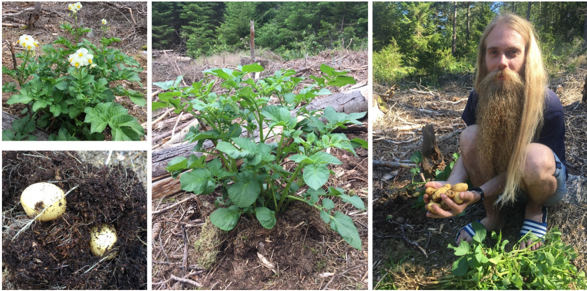
Image: The potato plants and the environment. Margaretha Häggström, 2020, photographs.