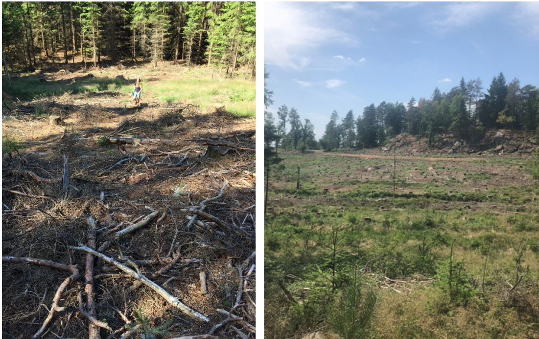
Image: Left: The clearcut before the second clearcut. Right: After the second clearcut.