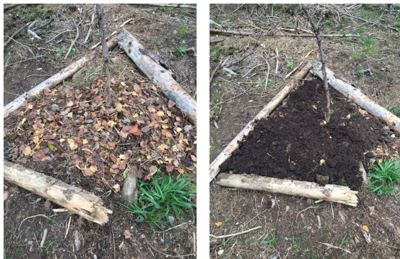
Image: One of the composts and its different layers of material.

Upon discovering the clearcut, we were moved to take action. Mårten initiated the project by crafting six insect hotels, recognising the critical ecological service provided by a diverse range of insects, particularly in pollination. We placed three of these hotels in pine trees at the top of the clearcut. Subsequently, we realized the importance of introducing plants and flowers to support bees and other insects, especially during the spring when bees emerge and require a nutrient source. Surveying the area, we concluded that establishing natural flowering beds was essential despite the challenges posed by the monoculture forest and the clearcut, which led to the depletion of soil organic matter and nutrients (Bowd et al. 2019). Without the forest canopy to mitigate solar radiation, the ground was prone to quicker heating and cooling. To address this, we decided to create a compost using various materials gathered from the surrounding environment, including soil, sand, leaves, woody stems, and vegetation. Recognising the need for a balance of carbon and nitrogen, we utilised the available resources. While the compost required several months to mature, we were eager to commence sowing immediately.