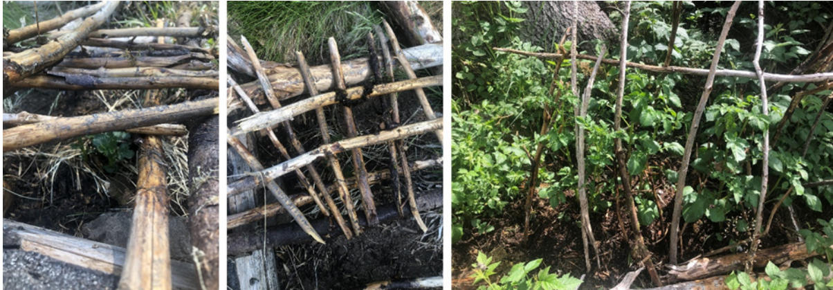
Image: We decided to protect the plants from animals while the plants were growing this year.

would recover, the regenerated forest's character would inevitably differ from its previous state. The analogy of viewing cutdown trees as individuals (Häggström 2020) emphasized that new trees could not simply replace the lost ones, acknowledging the persistent sense of loss. The ongoing growth of new trees and the formation of a novel forest constellation remained a process to observe. Being-in-the-clearcut sparked feelings of kinship and a connection to the evolving landscape.