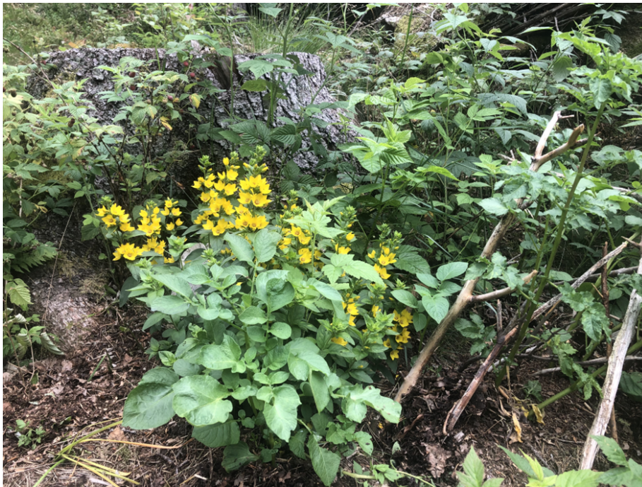
Image: Various plants growing together.

plant flowers and potatoes once more. The planting beds were deemed too valuable not to utilise. The weather in early spring was notably rainy and was followed by sunny, warm, and dry conditions in May and June. Watering became necessary, and despite efforts, many flowers dried out. To safeguard the potatoes from potential predation before flowering, branches were arranged as "cages" around the shaw, serving the dual purpose of protection and shading. With the arrival of rain in July, additional flowers were planted, and meadow seeds were scattered again. The clearcut transformed into a recreational and play space, marked by Margaretha's artistic creations using branches. The place ceased to be a sombre clearcut and evolved into a meaningful, personalized space. This new mode of being-in-the-forest was constructed through activities rather than contemplations, fostering experiences that contributed to newfound knowledge and understanding.