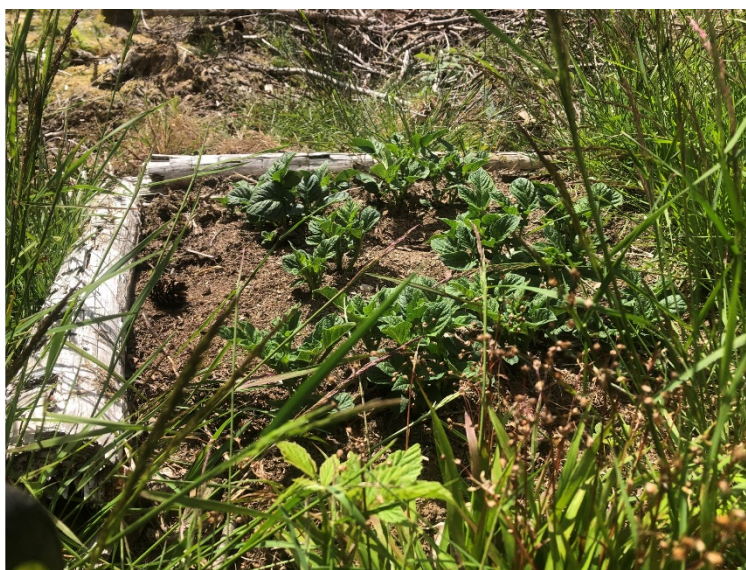
Image: Differences between year one and four; the environment is growing green. Margaretha Häggström, 2020 (left), 2023 (right), photographs.