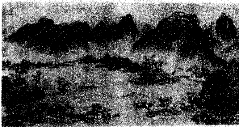
秋山行旅图局部之一 黄筌画 绢本 现藏台北故宫博物院 （局部之一）

From Tang Song Yuan Ming Minghua Daguan .