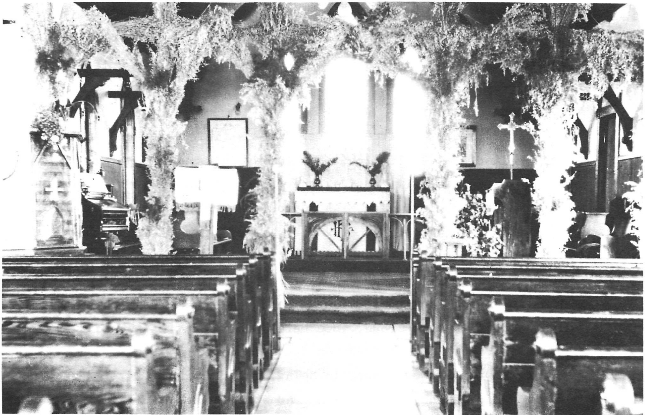
Interior view of St. Peter's Anglican Church, Okotoks. Decorated for the Harvest Festival, c. 1930.