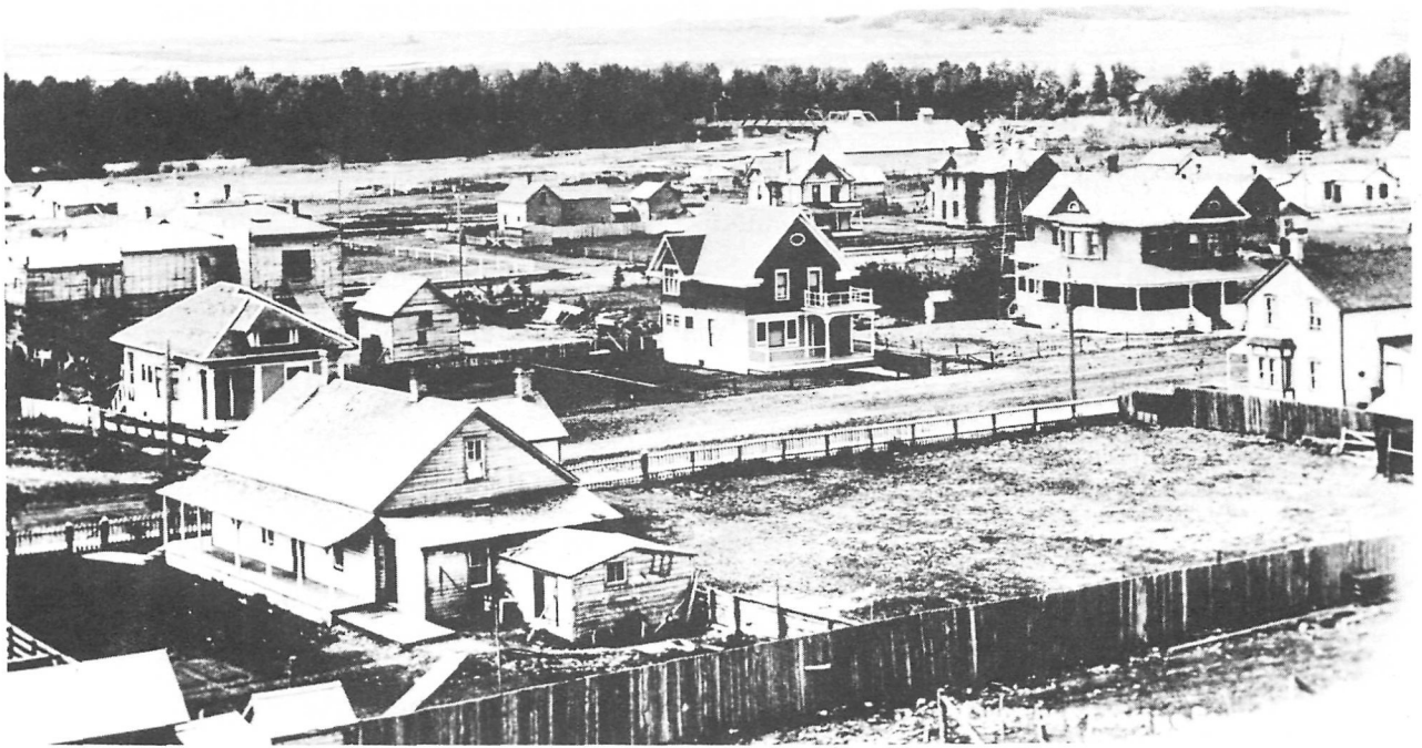
View of Okotoks, c.1912. Looking southwest towards Sheep Creek. The John Lineham house is in the left foreground.

It is difficult to believe that Okotoks owed its setting to any aesthetic appeal that it made to the engineers who chose the route for the branch of the Calgary and Edmonton Railway that was built south to Fort Macleod between 1890 and 1892. The terrain south of Calgary suggests that a line slightly further to the east would have been cheaper and easier to build and operate; its track would have avoided the stretch of river valley that has always been vulnerable to flooding when early summer rains transform the innocent and sparkling waters of Sheep Creek into a treacherous torrent. There had been a nucleus of settlement at this point long before 1890; indeed, local tradition maintains that a whiskey trader from Fort Benton, then the metropolis of Montana, had, as early as the 1860s, a post east of what became the townsite. The evidence for this early cultural penetration from the United States is flimsy but there is more reason to believe that the crossing at this point