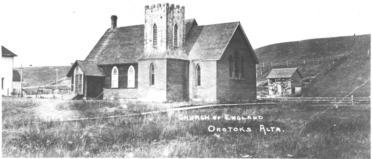
St. Peter's Anglican Church, Okotoks. Taken while the brick veneer was being applied. The Wyndham stable is in the background.