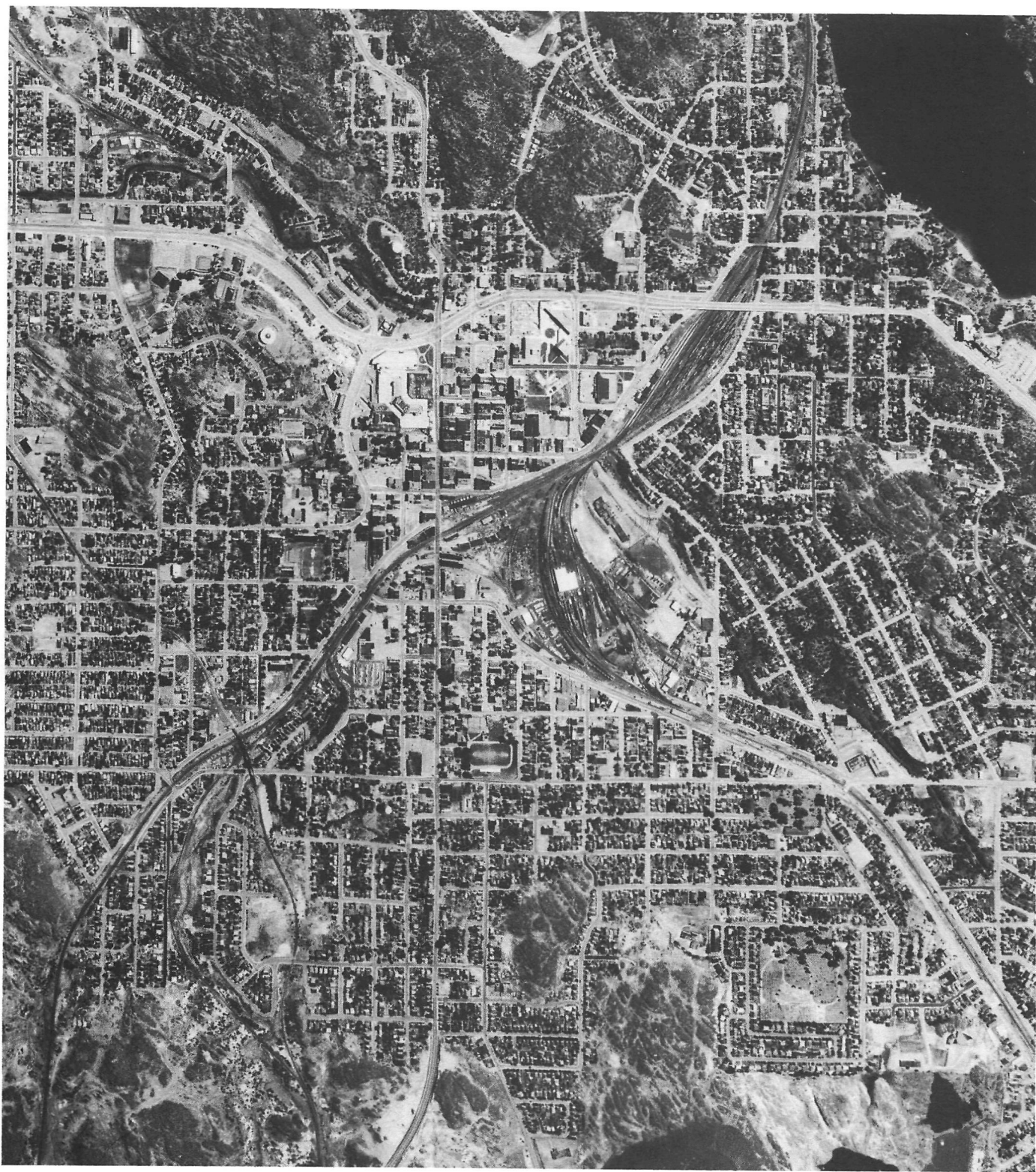
Sudbury, 1978. [NAPL, A24988-64].