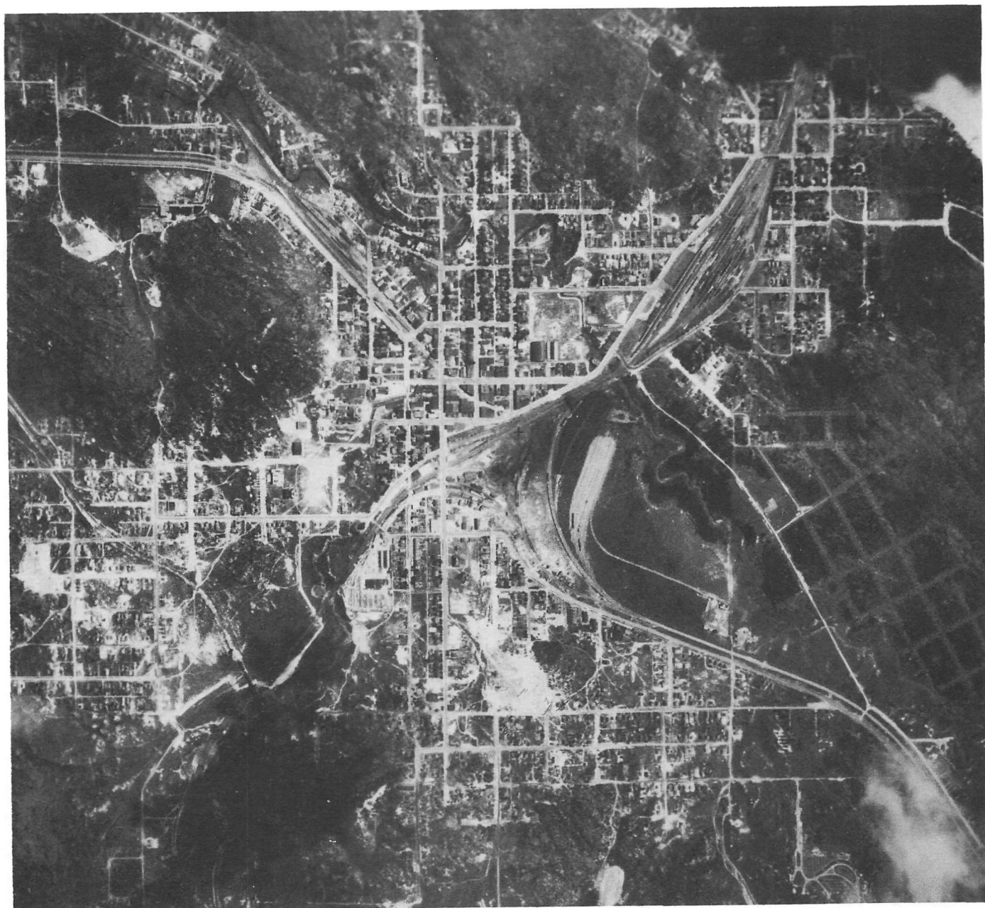
Sudbury, 1928. Showing C.P.R. Yards, Upper Right Quadrant. [NAPL, A517-94].