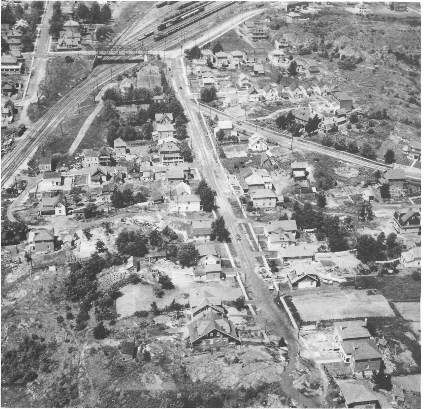
Sudbury, Portion of C.P.R. Yards, and adjacent housing, 1928. [NAPL, A169-66].