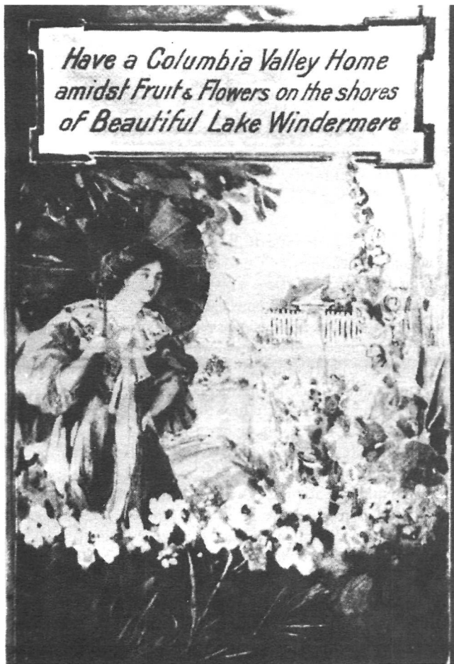
FIGURE 3. The promises made in this pamphlet (1911) left a legacy of disappointment that is visible in the landscape today. Fruit and flowers were never to be.