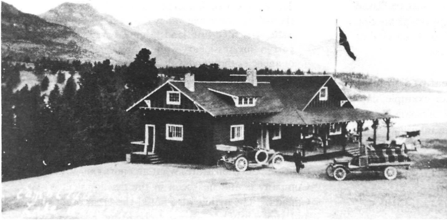
FIGURE 2. This clubhouse (ca. 1910) still stands in what is now a densely settled residential area.