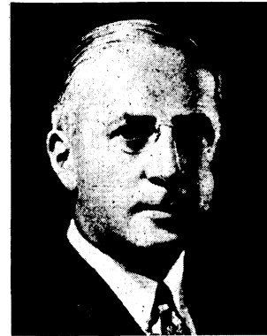
The Honourable J. L. Ilsley, Minister of Finance (Canadian Business, 1944)