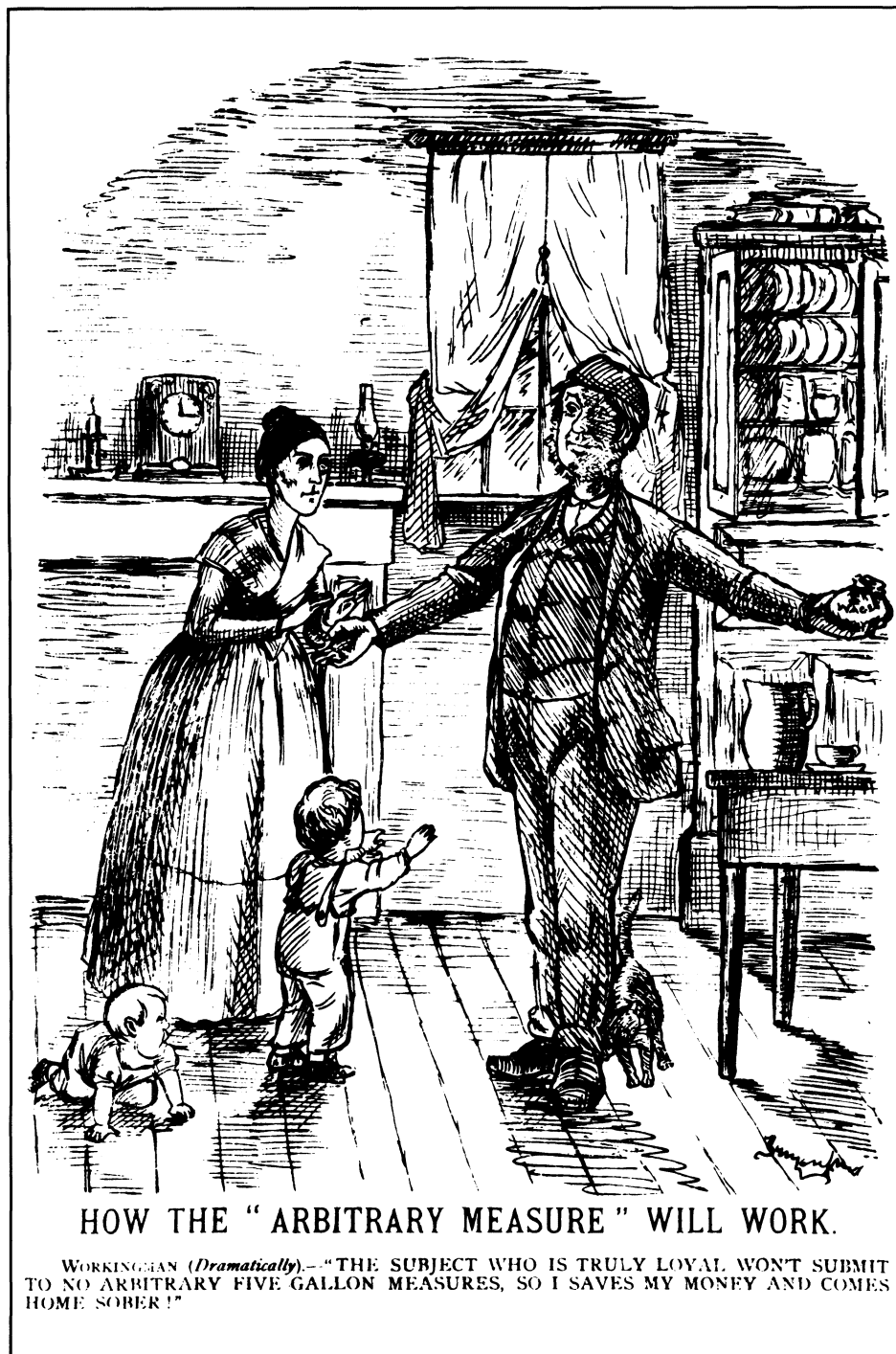
Figure 1: From Grip 9(12), August 11, 1877. McMaster University, William Ready Archives and Research Collections, Bengough Papers.

For middle-class prohibitionists, improving material conditions was anathema: to them, the only thing standing in the way of material improvement was the liquor traffic. Thus, two very different perceptions of the causal relationship between liquor and poverty were in evidence, and, at least until the early 1890s, the two perceptions were strongly conditioned by class. 16 William Sandilands showed clearly the gulf separating temperate, anti-liquor unionists and middle-class prohibitionists when he said that as far as the working class was concerned, "the only other problem that is equal to [the liquor traffic] is the combination of capital." 17