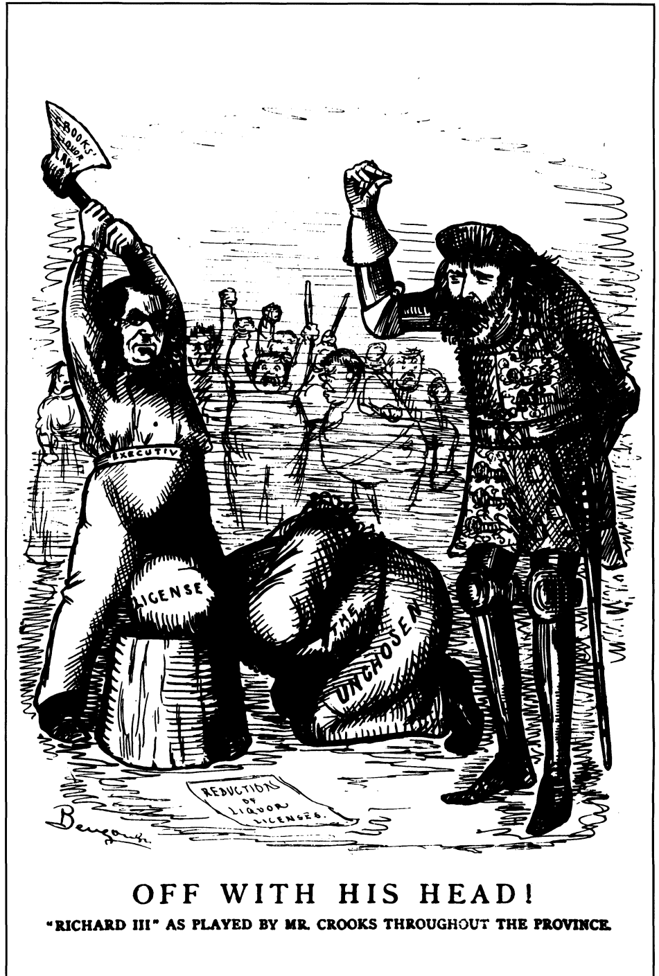
Figure 2: from Grip, May 6, 1876. McMaster University, William Ready Archives and Research Collections, Bengough Papers.

Even if, as some of its critics claimed, an important effect of the provincial appointment of commissioners was to create new opportunities for patronage at the Provincial level, the Act was still a major achievement in that it placed tavern keepers under the supervision of persons who did not depend on their favors. Under a system in which the municipal council granted licenses through the agency of an Inspector it had appointed, "the liquor interest virtually controlled the council; the licensees therefore practically issued their own licenses." 20 By favouring applicants of a particular political affiliation, the Inspector could have a profound influence on elections, since taverns served the crucial function of hosting political meetings, which generally had to be held indoors because local elections were held in January. In exchange for good work at elections, in hosting meetings, getting out the vote, and organizing mobs, tavern keepers could expect the opportunity to dispense petty patronage and to have a blind eye turned to minor license violations. For over a decade before the enactment of the Crooks Act, Toronto's Inspector had been Ogle Gowan, founder of the province's Orange Order, an organization with well-documented ties to Toronto's Tory machine. 21 It was for such reasons that George Albert Mason, Toronto's chief liquor detective, in 1868 called taverns "the bane of our cities." 22 As shown in Figure 2, the Crooks Act was not intended to stop