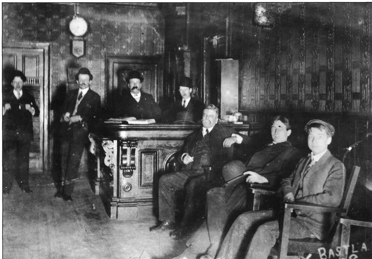
Figure 4: Interior, Bank Hotel, corner of Talbot and King Sts., London, Ont., 1908. Photo by Clifford S. Bastla. National Archives of Canada, PA 122703.

for the tavern. But attempts to provide alternative recreation were still fraught with difficulty. Coffee houses were not an immediate success; there were as yet no Sunday cars to High Park; parks were virtually useless in winter or at night; and libraries and reading rooms were not good places to socialize. Spectator sports were just beginning, and could not provide regular evening diversion. The tavern was, and is, difficult to supplant. As the subsequent century and a