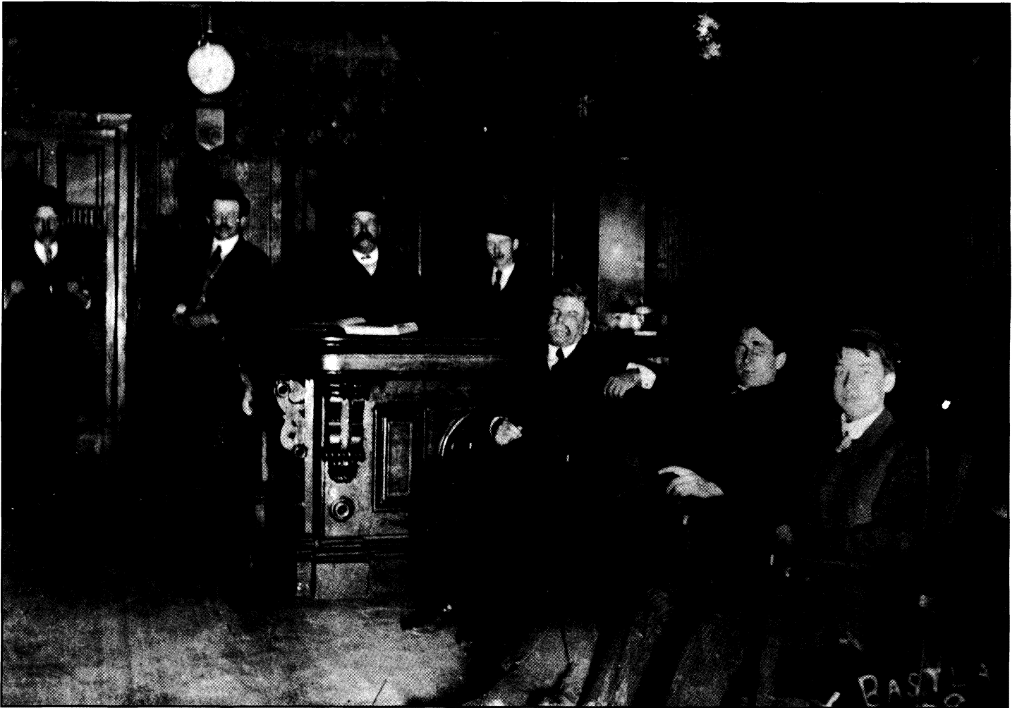
Figure 4: Interior, Bank Hotel, corner of Talbot and King Sts., London, Ont., 1908.

for the tavern. But attempts to provide alternative recreation were still fraught with difficulty. Coffee houses were not an immediate success; there were as yet no Sunday cars to High Park; parks were virtually useless in winter or at night; and libraries and reading rooms were not good places to socialize. Spectator sports were just beginning, and could not provide regular evening diversion. The tavern was, and is, difficult to supplant. As the subsequent century and a