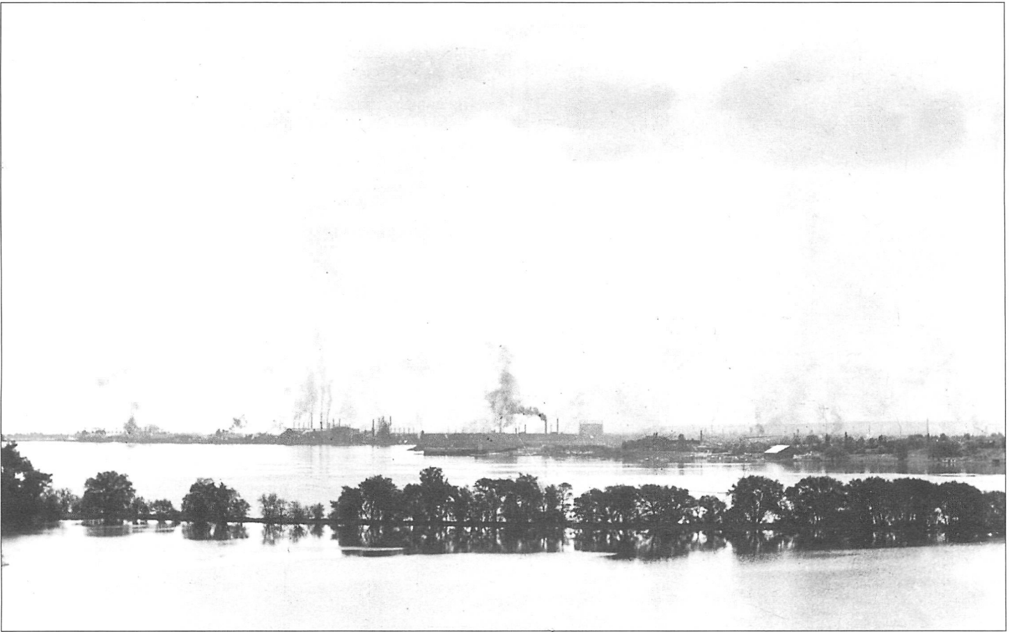
Figure 2: Hamilton Harbour, 1946. Looking southeast across the barbour from near Carroll's Point towards the industrial north end of Hamilton.

This exhibit emphasized some of the most prevalent issues that cities, and particularly industrial cities like Hamilton, faced in the early decades of this century. Needing to stimulate their economy, Hamilton developed an industrial base at the expense of the environmental conditions of the waterfront. Making acceptable trade-offs between economic growth and environmental degradation has been one of the most difficult challenges facing twentieth-century cities. Similarly, inequalities between the social classes, so carefully portrayed in this exhibit, are characteristic of the mandate and purpose of OWAHC, but have been unfortunately downplayed in much