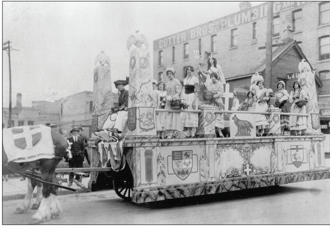
Figure 2: Italian float in Winnipeg's Diamond Jubilee of Confederation parade, 1 July 1927.

sacralized version of the community gathering in Assiniboine Park. An estimated fifty thousand people attended the service, which also featured a massive interdenominational choir of 1,340 voices, drawn from a dozen different immigrant communities. 84