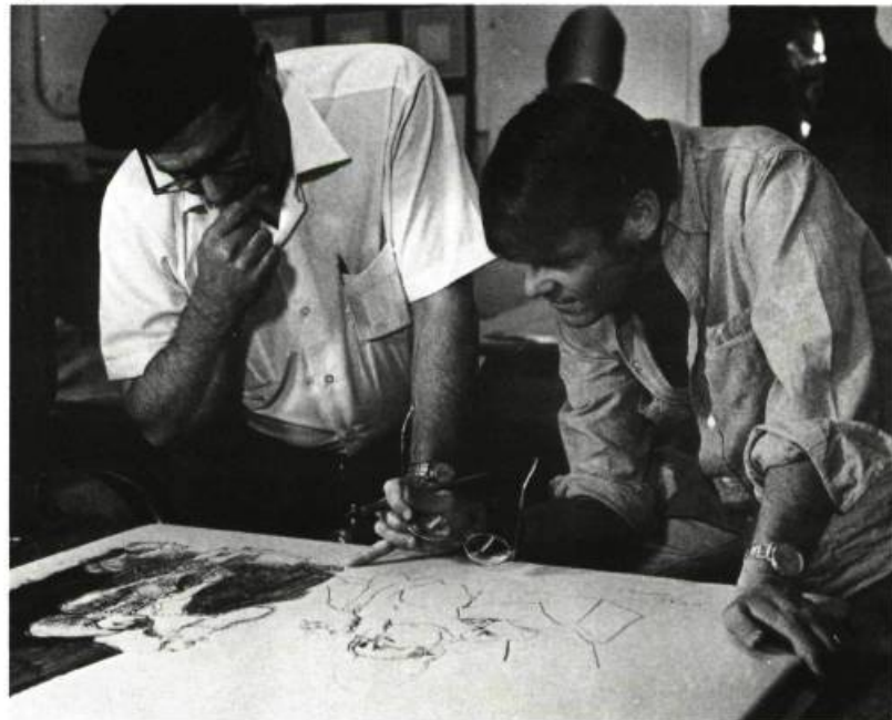
5./6. THE GRAPHIC GALLERY. René Derouin. Deux illustrations de Deadline, sérigraphies d'un ouvrage imprimé à Montréal en 1969.