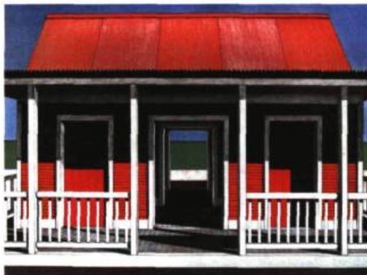
"Casita al mar" (Little House By The Sea), 1974, lithograph, 50.8 x 74.9 cm - 20" x 29 1/2"

DURING A LIFETIME OF TRAVEL AND ARTISTIC EXPLORATION, EMILIO SANCHEZ WAS ALWAYS PREOCCUPIED WITH THE ORDERING OF THE VISIBLE WORLD ACCORDING TO HIS OWN CAREFUL SENSE OF ABSTRACTION. EVERY NEW ENVIRONMENT BECAME THE SOURCE FOR ASTUTE PICTORIAL RENDERINGS THAT WERE AS CONCERNED WITH A SENSE OF PLACE AS THEY WERE A SENSE OF DESIGN. CONSTANTLY REORDERING HIS VIEWS OF ARCHITECTURE, THE LANDSCAPE, SEA AND CITY, SANCHEZ RELIED ON A STYLISTIC APPROACH BASED ON RADICAL SIMPLIFICATION OF FORMS AND PRECISE AND CAREFULLY ILLUMINATED COLOR HARMONIES AND CONTRASTS. HE WORKED IN SERIES, OVER MANY YEARS, TO FINALLY "OWN" HIS SUBJECTS — CARIBBEAN CASITAS, VERDANT LANDSCAPES WITH SENTINEL PALMS, THE BLUE SEAS OF HIS BELOVED ISLAND OF CUBA, MANHATTAN ARCHITECTURE, AND BEAUTIFUL FLOWERS.