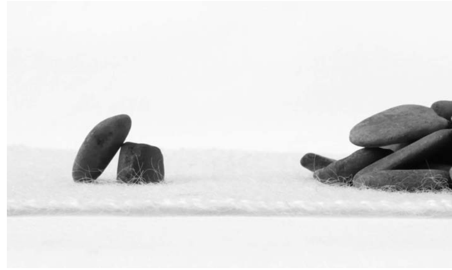
Fig. 15 Sustainable artefact, detail 2