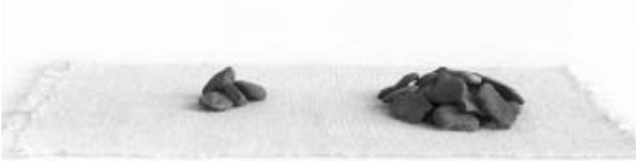
Fig. 14 Sustainable artefact, detail 1