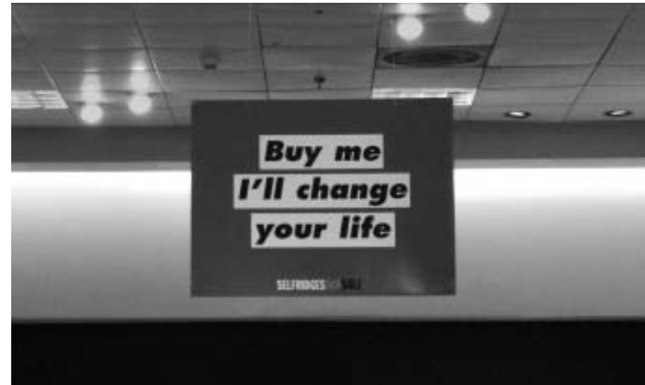
Fig. 1 Marketing banner “Buy Me”, Selfridges department store, Trafford Centre, Manchester

I’ll change your life” and “You want it, You buy it, You forget it” (Fig. 1). Similarly, the U.S. auto manufacturer Hummer, which has received criticism for its oversized vehicles aimed at the consumer market, launched a TV commercial that focused on a man buying vegetarian produce who is later seen at the wheel of a Hummer, accompanied by the line “Restore the Balance” (Hummer, 2006). By employing irony and humour, such examples demonstrate the infinite adaptability of industrial capitalism, which allows it to undermine virtually any form of critique (Miller, 2005, 2).