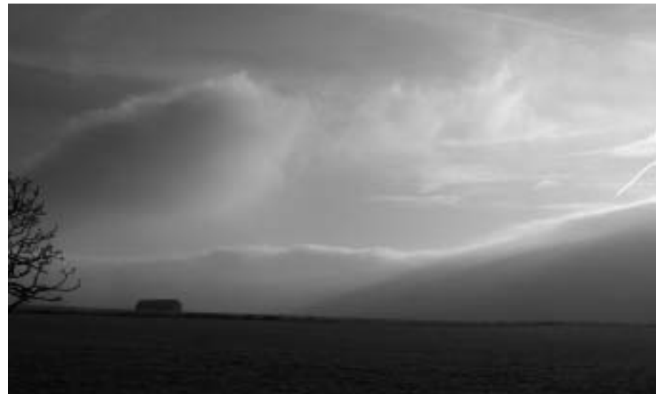
Fig. 5 Countryside adjacent to author's place of work

Bearing in mind these priorities and considerations, the rural area immediately adjacent to my place of work was visited (Fig. 5). It is a place of high moors and deep fertile valleys. The main occupation is farming, and the predominant sight is dry stone walls enclosing pastures filled with different varieties of sheep. Streams and rivers cut through the moor land, with gravel beds and ancient stepping stones, and stone farmhouses and barns stand out on the horizon (Figs. 6-9). Research about the area revealed a small cottage industry of rare-breed sheep rearing, together with the spinning and weaving of their wool.