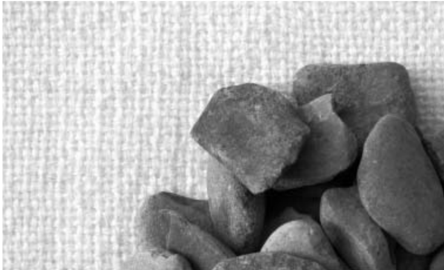
Fig. 13 Sustainable artefact: a 'tallying device' – 33 river stones on a woven cloth