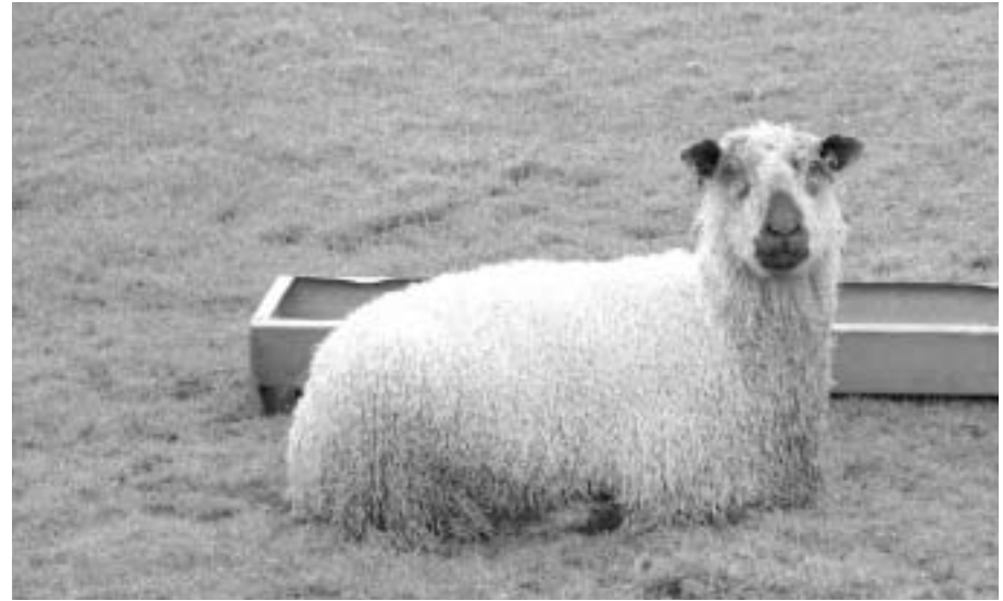
Fig. 11 Teeswater rare breed sheep