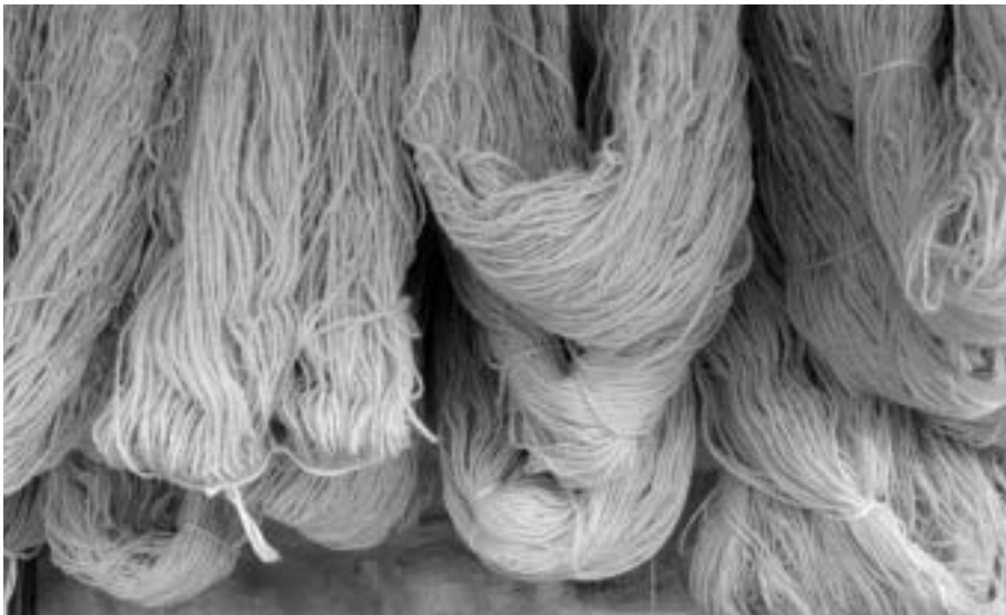
Fig. 10 Wool from Teeswater sheep