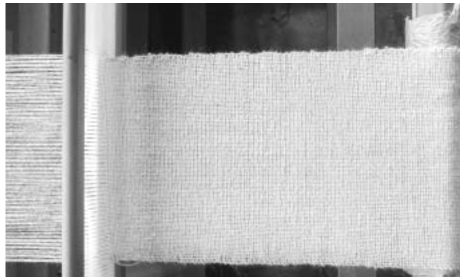
Fig. 12 Woven cloth on hand loom