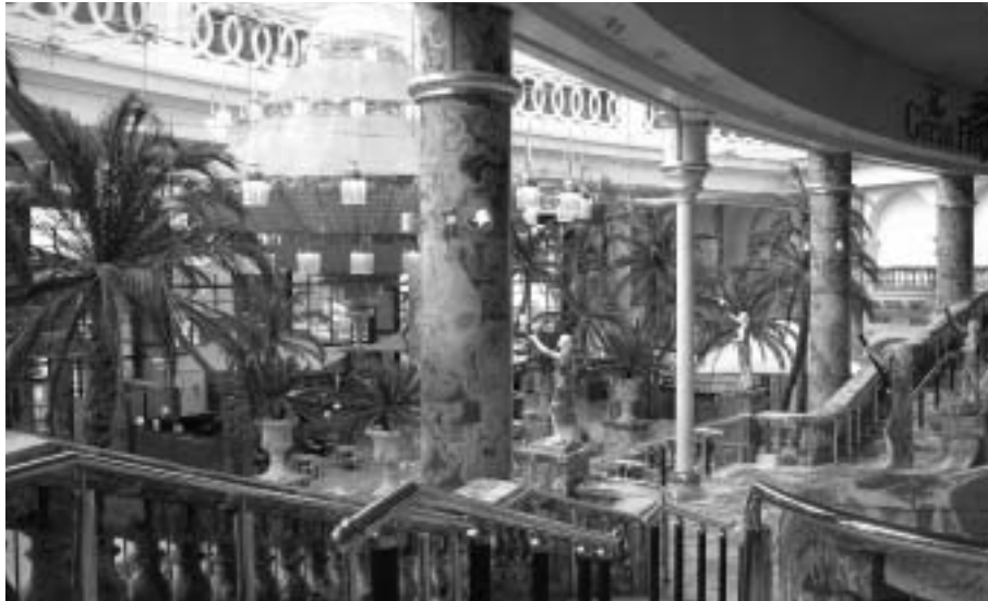
Fig. 4 Grand marble and brass staircase, Trafford Centre, Manchester

These kinds of products and services exacerbate already severe environmental problems – directly through their contribution to cumulative effects and indirectly through the dissatisfaction and cravings they foster.