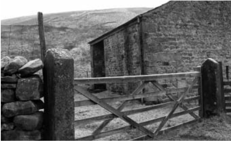
Fig. 9 Stone Barn