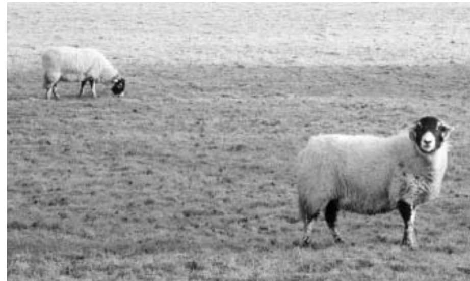
Fig. 7 Sheep pasture

woven on a small hand loom, was ready (Fig. 12). The stones were then placed on the cloth to form the simple ‘tallying device’, and the artefact was complete (Figs. 13-15).