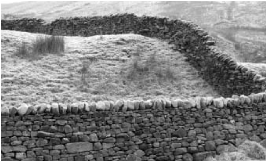
Fig. 6 Dry stone walls

Reflecting on these experiences and findings, and referring to a previous study that looked at objects used as aids for inner development and contemplation, (such as the Buddhist prayer wheel, prayer beads and the Jewish prayer shawl) (Walker, 2006, 39-51) I was reminded of references to an ancient type of tallying device used for keeping track of meditative sayings or prayers (Schaff, 1886, 367; Schaff, 1889, Ch.32; St Paul, 2000, 24). The ‘device’, used since the 3 rd century, consists of a simple pile of stones. To keep track of the spiritual exercises, each time a saying or mantra is completed, a stone is moved from the pile, to form another adjacent pile. Combining such a device with the local cottage industry of weaving would enable a simple, illustrative, functional object to be produced that would fulfil all the priorities set out for the project.