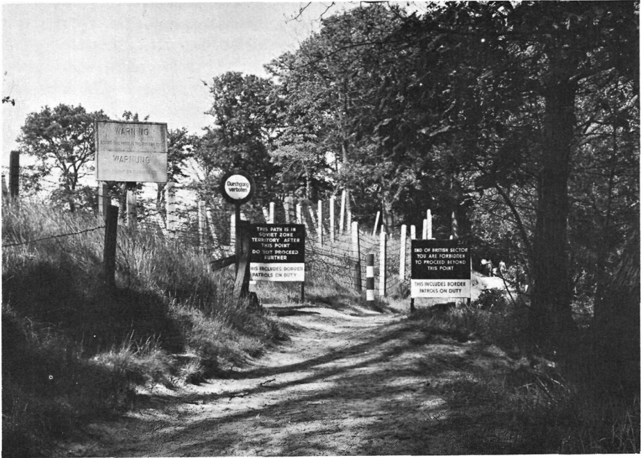
Photo 3 Accessway to Erlengrund and Fichtenwiese.

On April 5, 1964, three British Military Policemen were arrested by East German border guards as they tried to walk to Erlengrund and Fichtenwiese across Communist territory. Following British protest they were released by a Russian Army officer. Since then, warning signs have been posted at the beginning of this accessway (Landesbildstelle May 1967).