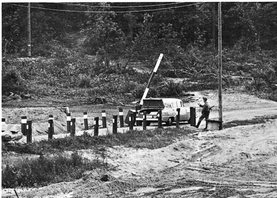
Photo 1 Access to Steinstücken.

The only ground access to the isolated village of Steinstücken is a roadway, 1200 meters long. Before the 1971 Berlin agreement went into effect this accessway was under complete East German control.