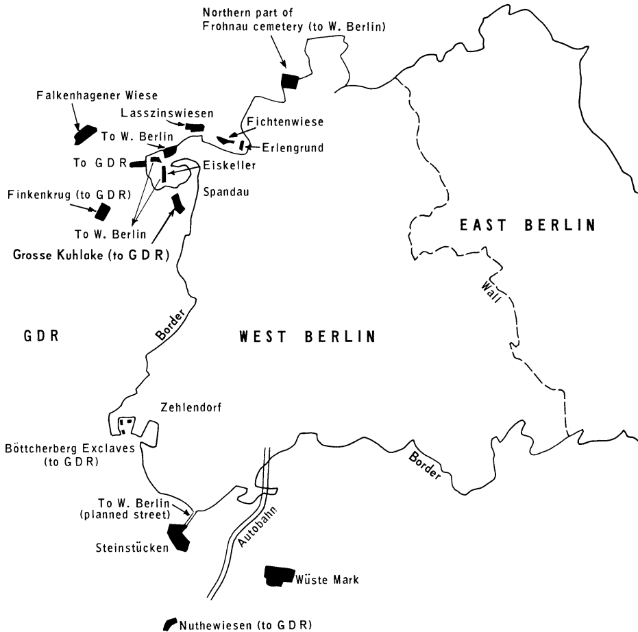
Figure 1 The exclaves of West Berlin.

When Western officials began casting around for likely areas of improvement that could be easily brought into the Four-Power talks, a suggestion was made by this writer to include the Berlin « exclaves » or « enclaves » (figure 1) — depending on one's point of view. 10 The idea, as