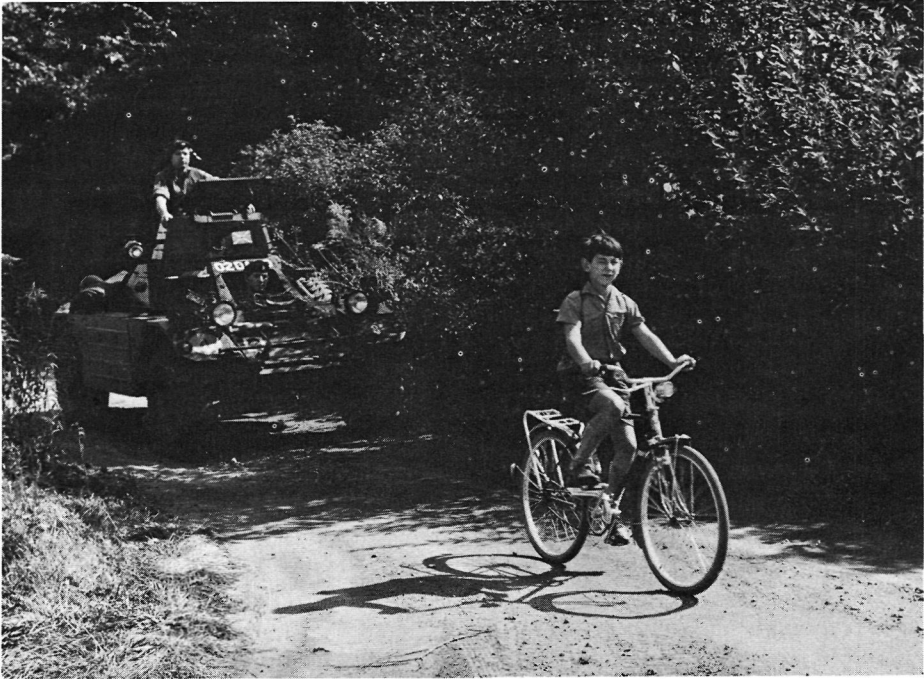
Photo 2 Eiskeller schoolboy with British military Escort.

In a show of the flag following the erection of the Berlin Wall in August 1961, a British «Landrover» was assigned to guard the solitary schoolboy in Eiskeller as he rode his bike back and forth along the narrow Western track connecting his home in East Germany to the District of Spandau. Now, however, area school children are picked up in an official car and returned by a district representative; and the armored personnel carrier, previously on school patrol duty, is on permanent patrol of the British Sector boundary (Landesbildstelle Berlin, August 1961).