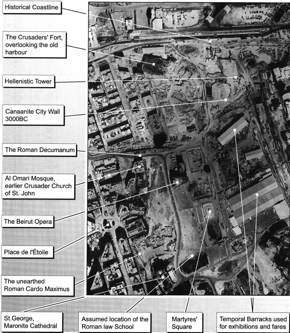
Figure 1 : Aerial photo showing the face of downtown Beirut in 1995

...after demolition had begun. A number of archaeological digs disclosed various layers. The different digs disclose ottoman, byzantine, roman persian, hellenistic, phenician and canaanite layers : a timespan of 5700 years.