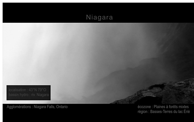
FIGURE 3 Chistian Calon, Continental Divide , 2011, Niagara Falls sequence.