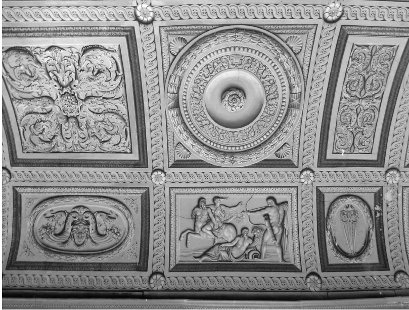
FIGURE 9 A ceiling in the Château de Tanlay, France, an example of trompe-l'oeil . 19

19.