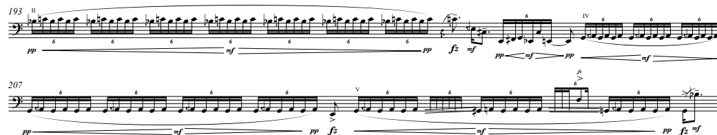
FIGURE 4 Ken Ueno, Chimera , beats 193–217.

Similarly, a fast passage in Ken Ueno's Chimera (Figure 4) sounded muffled in a pre-concert practice. At one point in my learning process, I decided to tune the cello to A=392 Hz instead of A=415 Hz because I worried that the high tension of the scordatura top string, tuned almost to F#, would lead to broken strings, especially in humid weather. Playing on the second string was clear, but when the passage dropped to the fourth string, I didn't like the cello's projection: it was rather "flubby." Furthermore, sliding to sul ponticello was quite different and difficult. The grainy resistance of gut strings doesn't give way to quick transitions as well. I hadn't realized beforehand that tuning a semitone lower would affect the clarity of the gut strings so greatly. The piece demands constant adjustment to a mixture of elements (bow speed, contact point, weight, tuning, string tension, and thickness) with each passage, and I didn't quite know how to resolve the issue in string tension on the fourth string. In the end, as I play the piece in concert, I now keep the cello