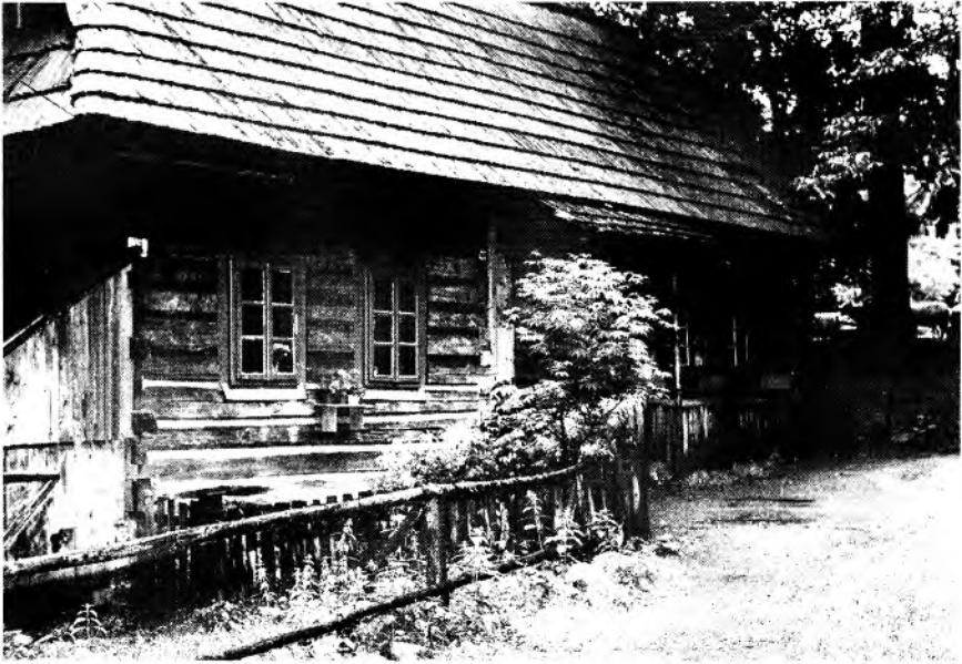
1. Regional style log construction, Villa "Tea."

town park, not far from a substantial wooden stage situated opposite rows of low wooden benches. The beautiful log homes fulfill part of my imagined picture of Podhale, but it is the music-culture on the stage that brought me to this corner of Poland. The music is presented on a stage that is raised on the far side of a small still pond opposite the audience benches. The pond acts as a moat, a liquid barrier ensuring separation between the performers and the audience. 3 The backdrop of the stage features a large timber structure in the form of a triangle suggesting the gable of a Górale style house. A banner across this frame proclaims "Poroniańskie Lato" or "Poronin Summer" [photograph 2].