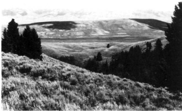
FIGURE 4. Typical Pinedale-equivalent terminal/recessional moraine complex, Deer Creek Canyon.

Complexe morainique frontal et de récession caractéristique d'épisodes corrélatifs au Pinedale, Deer Creek Canyon.