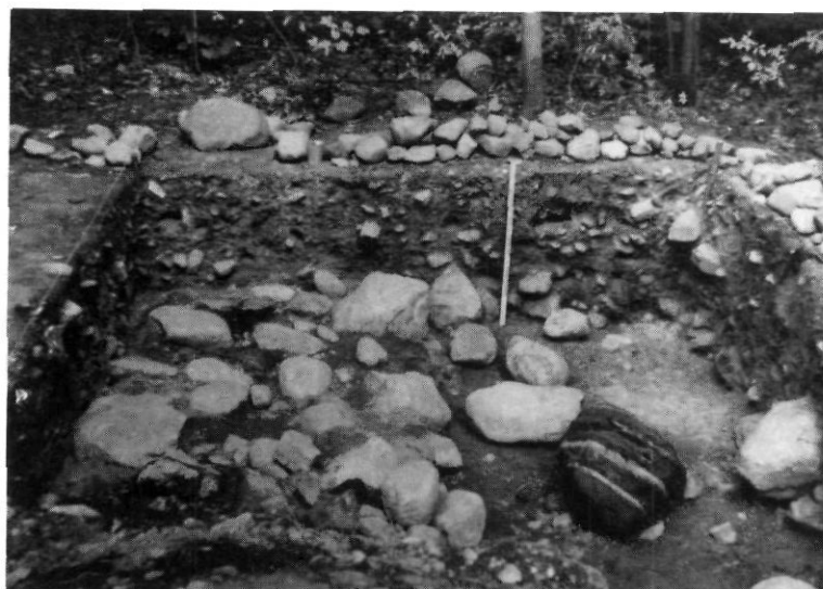
FIGURE 3. Boulder bed with meltwater sands and section of overlying till. Lit de blocs dans des sables fluvio-glaciaires et coupe du till sus-jacent.