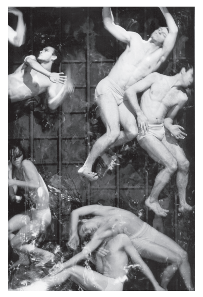
Fig. 2. Körper (Bodies), Schaubühne am Lehniner Platz, Berlin (Co-production with the Théâtre de la Ville, Paris), 2000. Direction and choreography: Sasha Waltz.