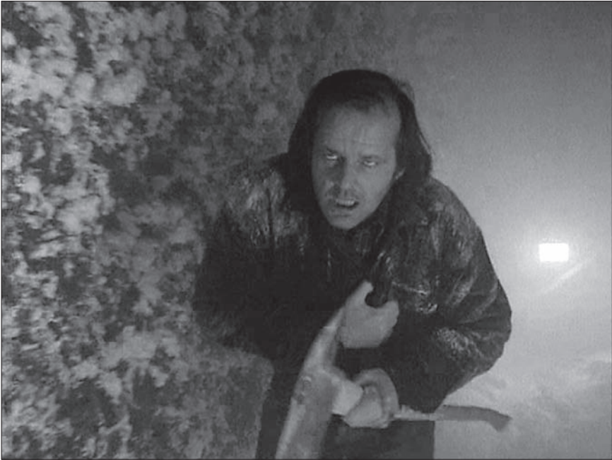
Fig. 3. Real actor, fake maze: Jack Nicholson in The Shining (Stanley Kubrick, 1980).