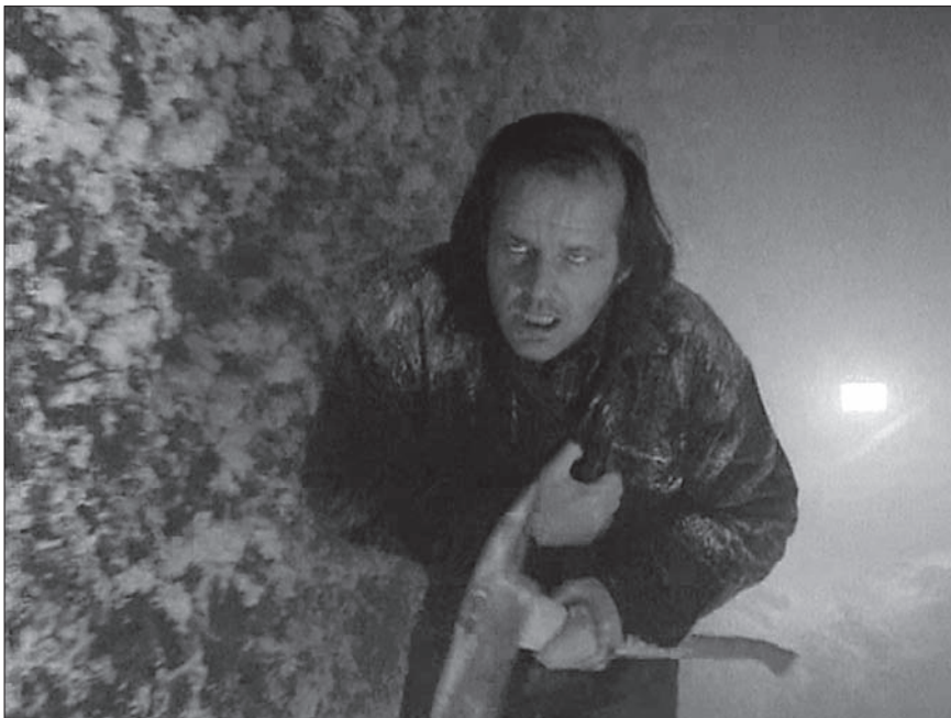
Fig. 3. Real actor, fake maze: Jack Nicholson in The Shining (Stanley Kubrick, 1980).