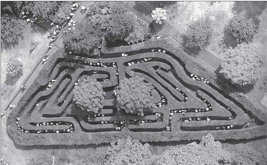
Fig. 1. The real maze at Hampton Court.

A labyrinth is a very common structure in many types of games. It is also a perfect illustration of the difference between a game object and a fictional object. Labyrinths exist in the real world, in fictions, and in games, from Pac-Man (Namco, 1979) to The Chronicles of Riddick: Escape from Butcher Bay (Vivendi Games, 2007). A very famous real-world labyrinth would be the hedge maze at Hampton