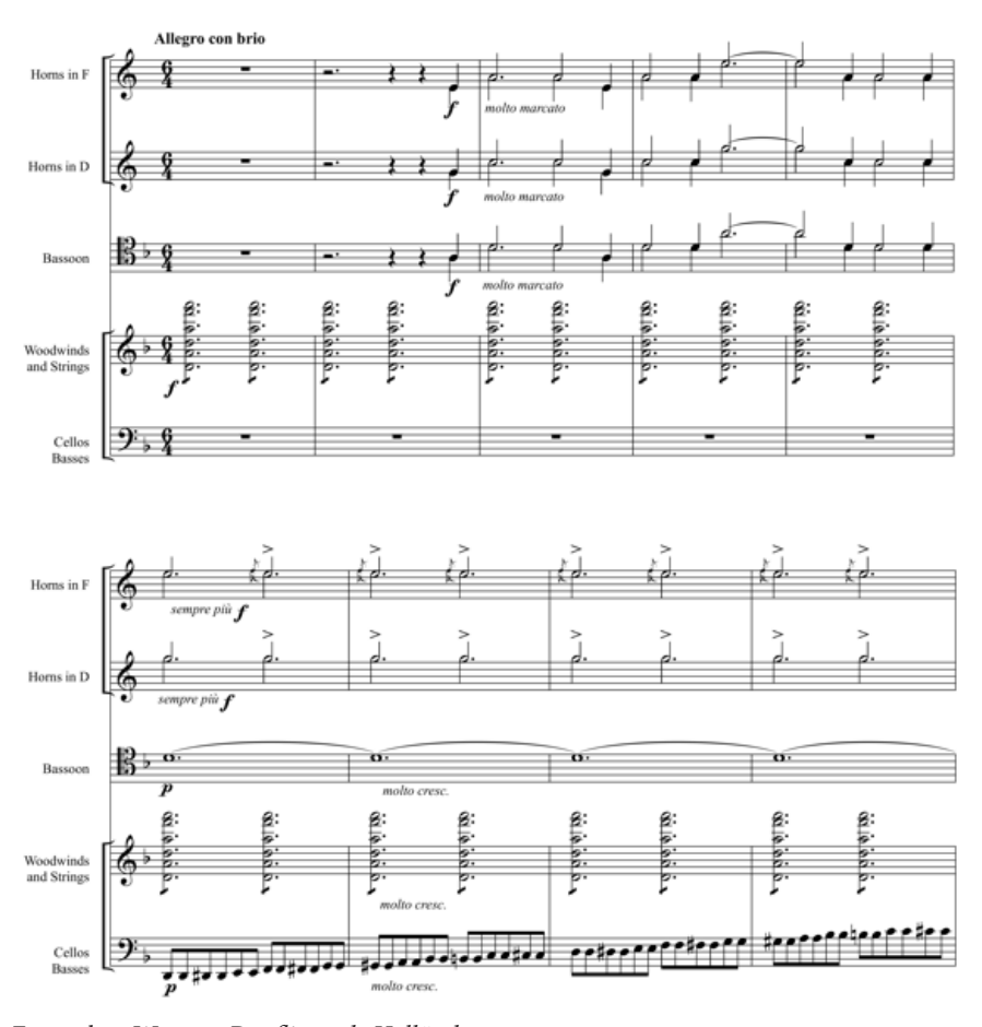
Example 1. Wagner, Der fliegende Holländer: overture, mm. 1-9

sea and stormy weather, but to the musical topic of the hunt. The overture begins in D, the key of the traditional French trompe de chasse or hunting horn and a key often used for pieces that evoke the hunt.<sup>10</sup> It is in a compound metre, specifically, 6/4, with an emphasis on trochaic rhythms that are frequently used in the hunting topic to recall a horse's gallop. Finally, there is the dominating presence of the horns, a very powerful signifier of the hunt.<sup>11</sup>