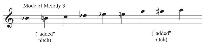
Example 9: Mode of melody 3

Beginning on page 54, amidst this dense counterpoint, Vivier introduces melody 3 in voice 1. It begins on B-flat, like melody 1, and is based on a transposed version of the mode of melody 1, as illustrated in example 9. Like melody 1, it uses all but one pitch (F-sharp) from an octatonic scale, but adds two pitches extraneous to that scale: B and G-sharp. These additional pitches are each a major third away from the point of symmetry of the ambitus of this melody, E and D-sharp: B is a major third below D-sharp, and G-sharp a major third above E. This nine-note melodic mode can be seen as an outgrowth of the work's initial mode, just as the important pitch cell [0145] of melody 2 is an expansion of the [0134] cell from melody 1.