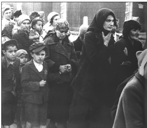
Figure 1. The woman to whom Shekhinah is dedicated (Rodal 1988)