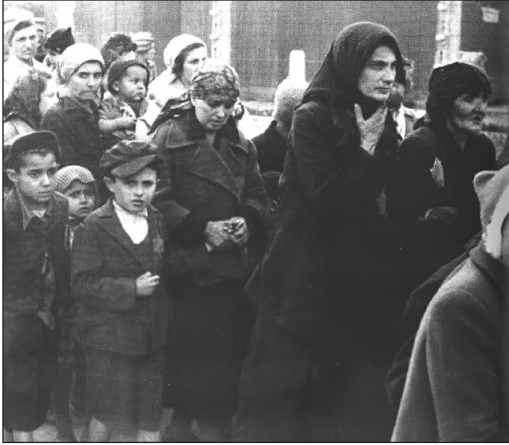
Figure 1. The woman to whom Shekhinah is dedicated (Rodal 1988)