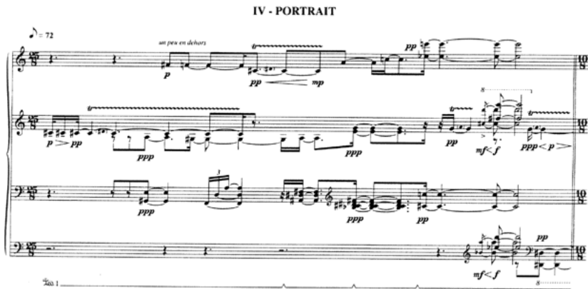
Figure 3. Portrait , movement IV from Tombeau (bar 1)

personal connection to the work and helped you with forming your beautiful interpretation?